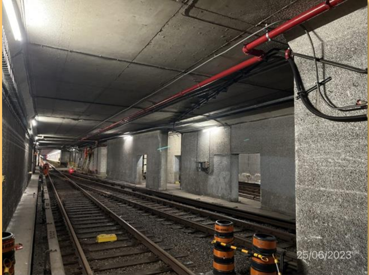
Dry fire line installation within Finch Tail Track