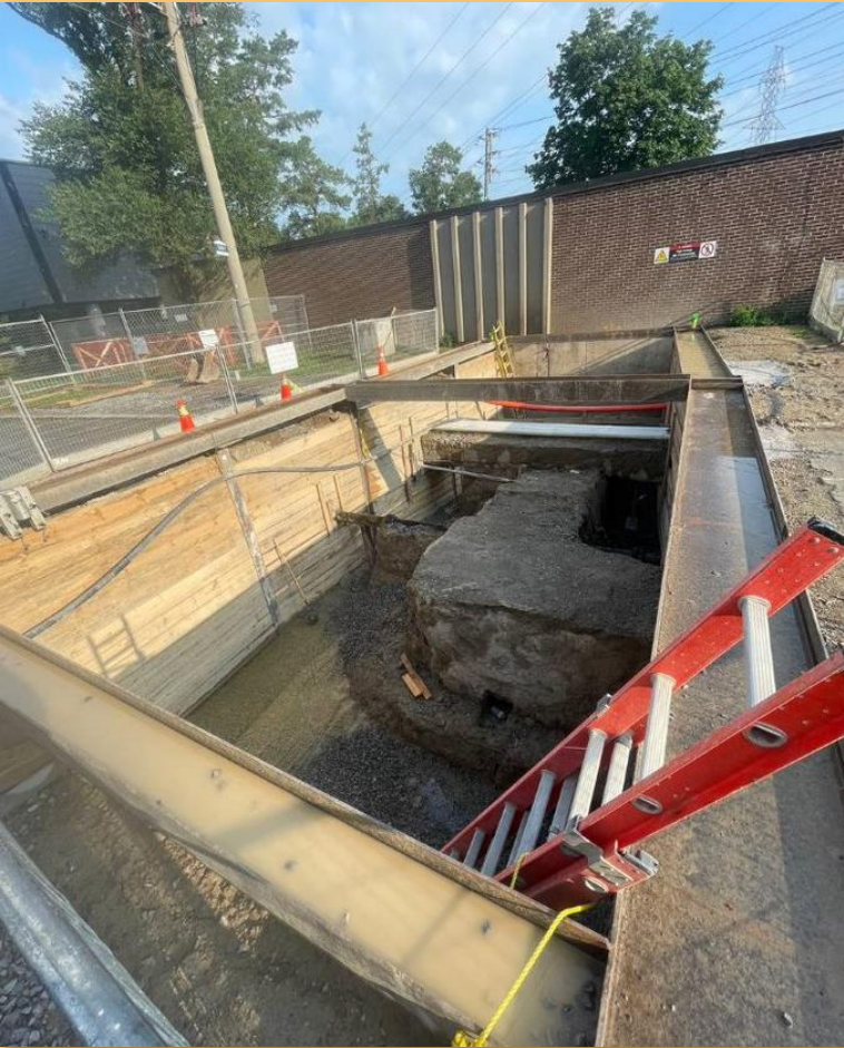
Excavation on Hendon Ave ( TPSS)