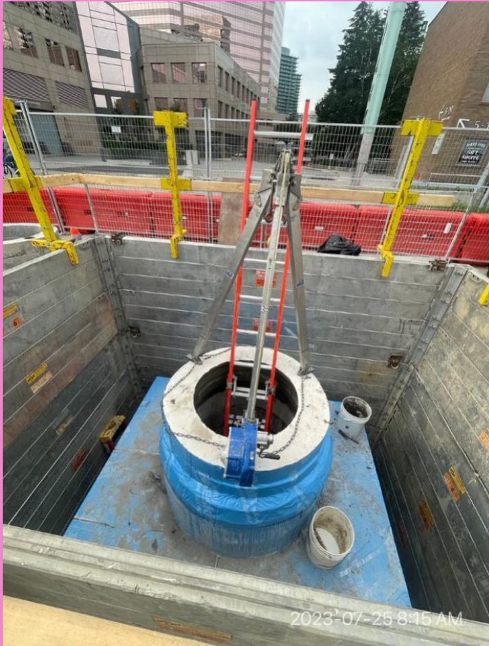
Maintenance chamber being installed