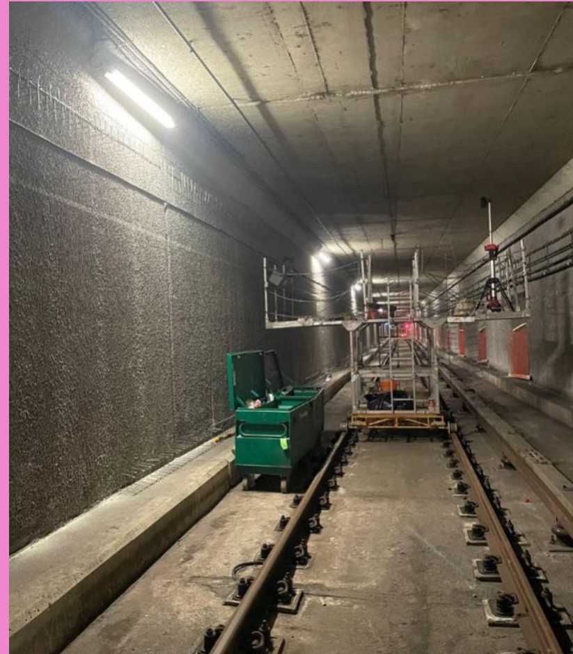
Scaffolding system for TTC interior work