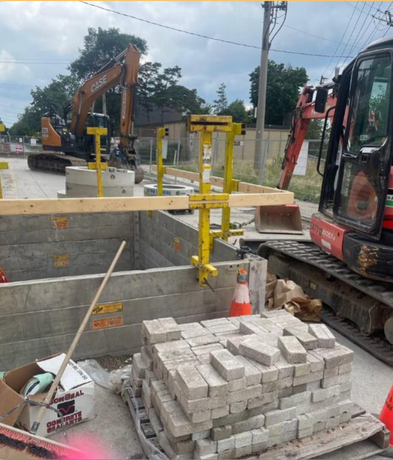
Maintenance hole excavation on Hendon Ave