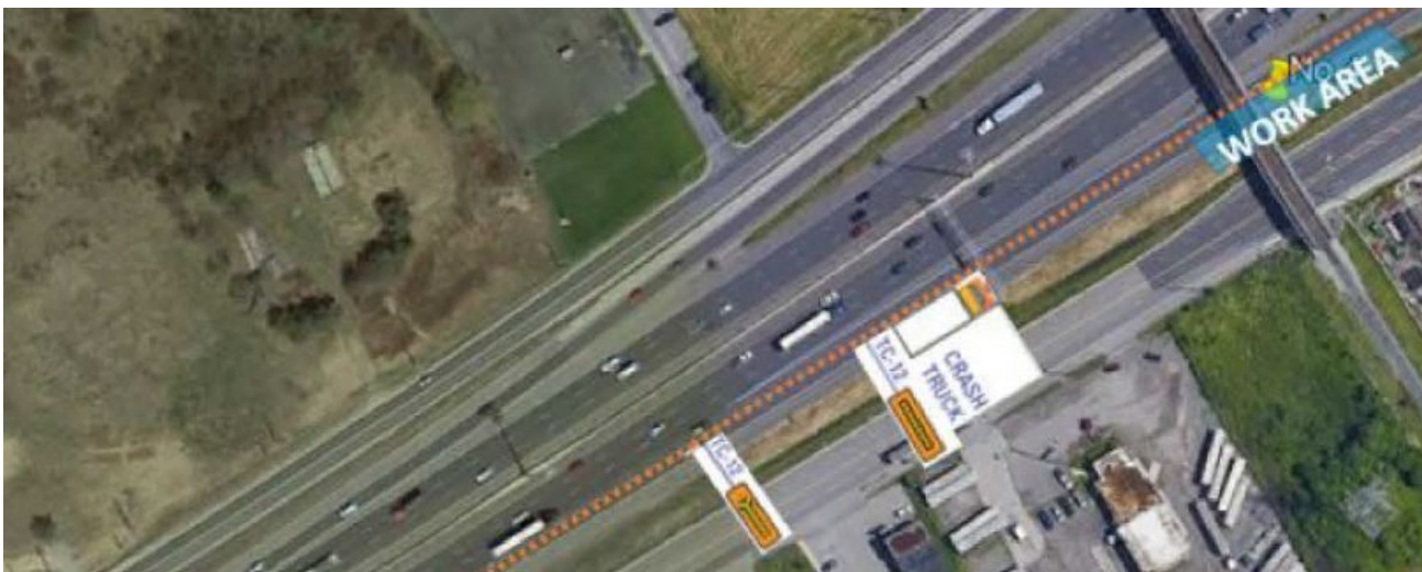
Highway 401 Eastbound Off Ramp Right-lane Closure