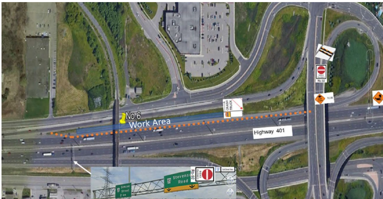
Highway 401 Westbound Onramp Closure (Stevenson Road)

This construction notice can be translated into a different language upon request by emailing us at DurhamRegion@metrolinx.com .