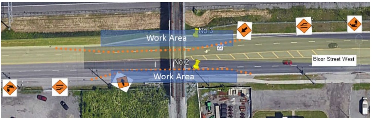
Bloor Street West (Eastbound and Westbound) Work Area and Lane Closure