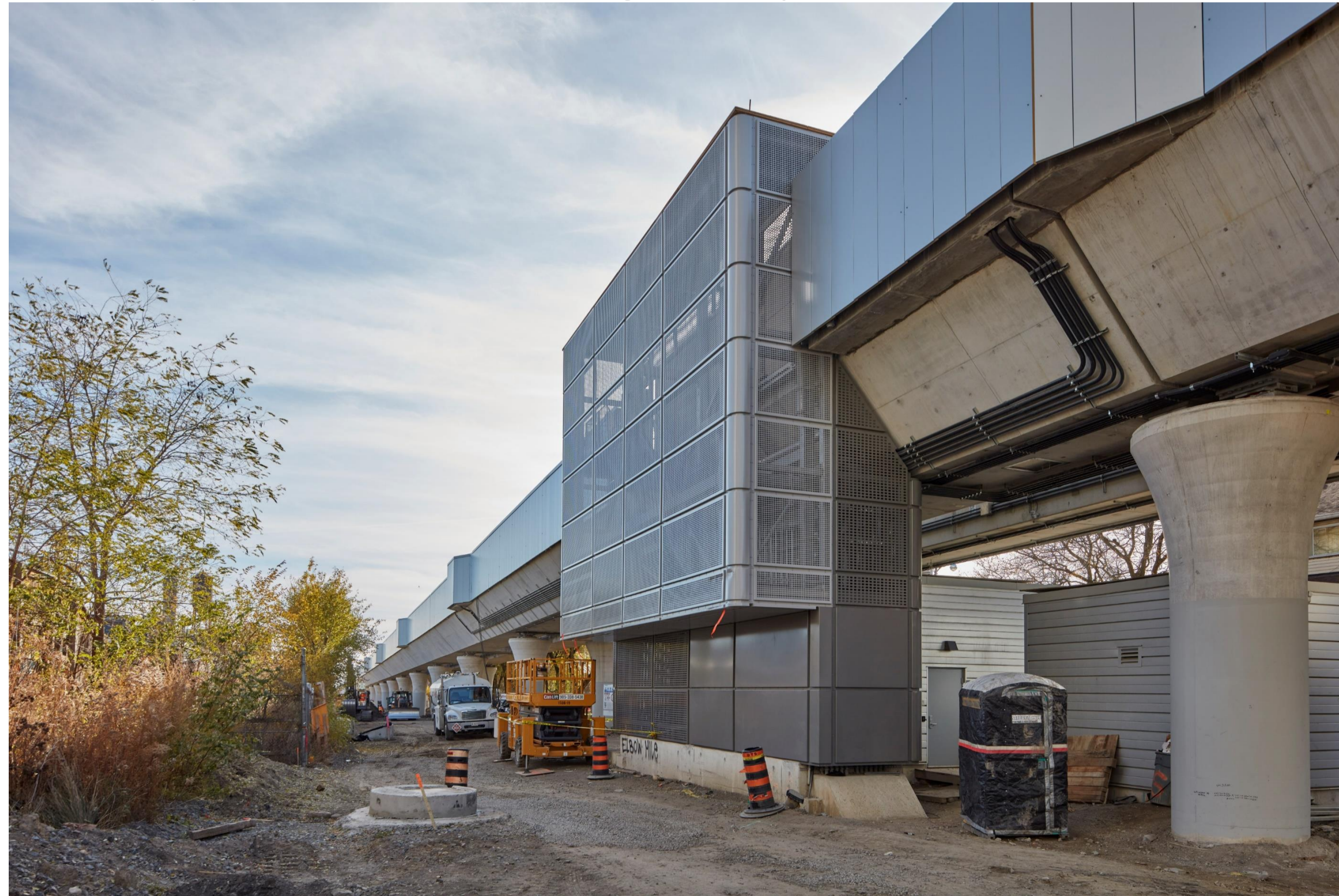
Electrical and Communications Rooms and Emergency Egress Stairway.

Work is completed in the Electrical and Communications Rooms in the Metrolinx rail corridor, adjacent to Antler Street. The structural work for the buildings is completed. The installation, testing and commissioning of the electrical and communications equipment inside the buildings is completed.