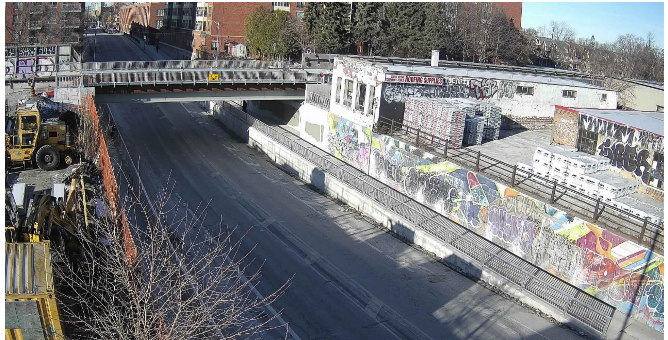
Bloor St Bridge