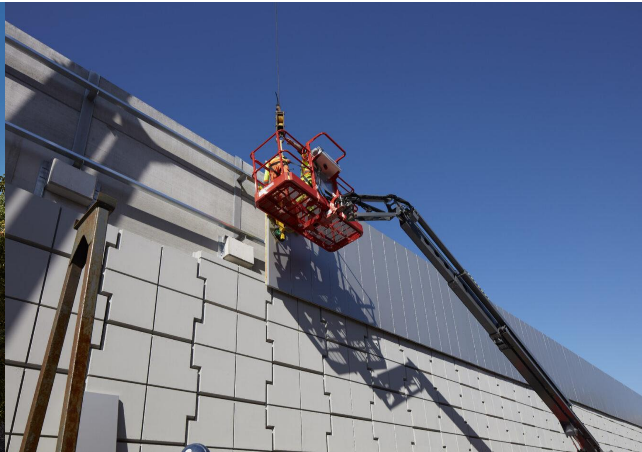
Cladding installation on the Elevated Guideway