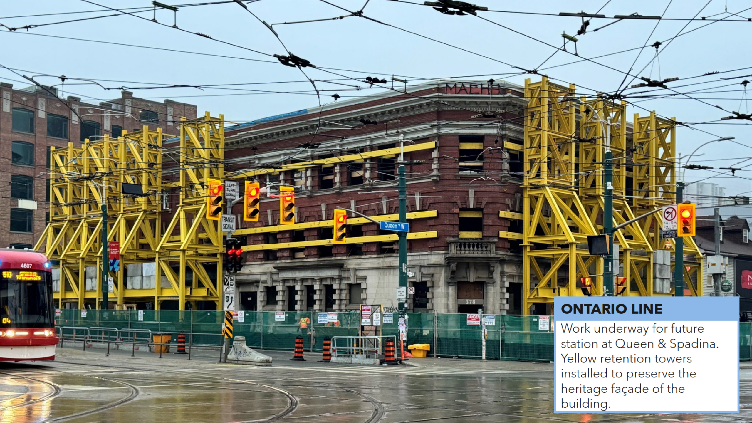
ONTARIO LINE Work underway for future station at Queen & Spadina. Yellow retention towers installed to preserve the heritage façade of the building.