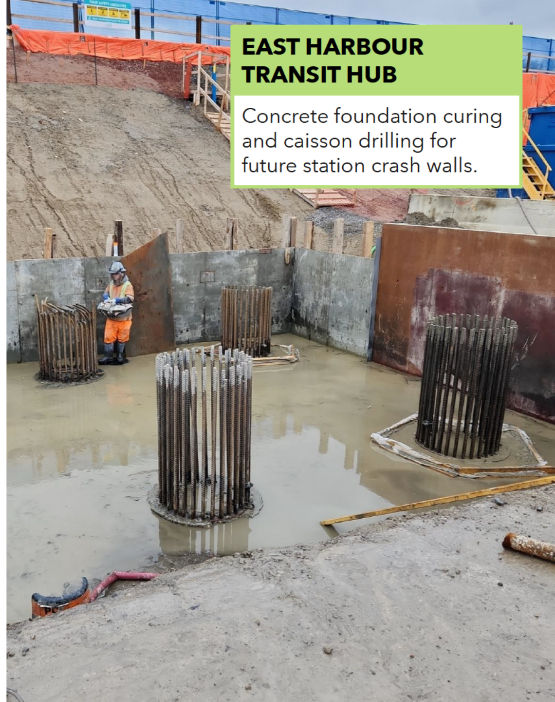
EAST HARBOUR TRANSIT HUB Concrete foundation curing and caisson drilling for future station crash walls.