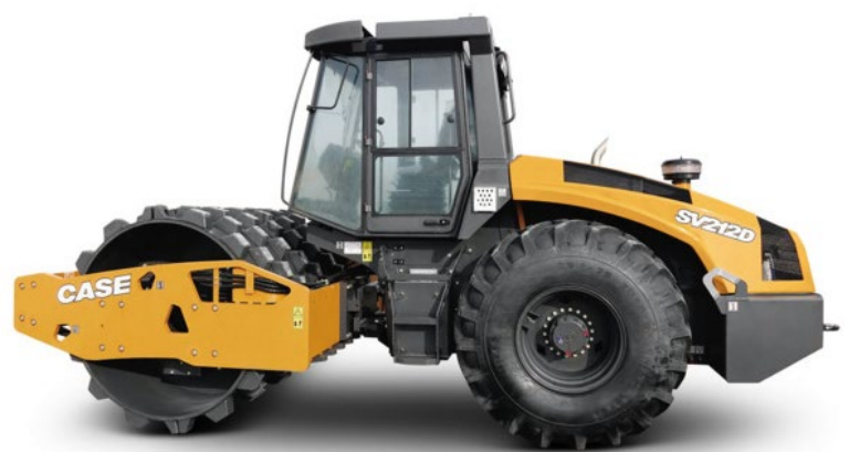
Example of a compaction roller