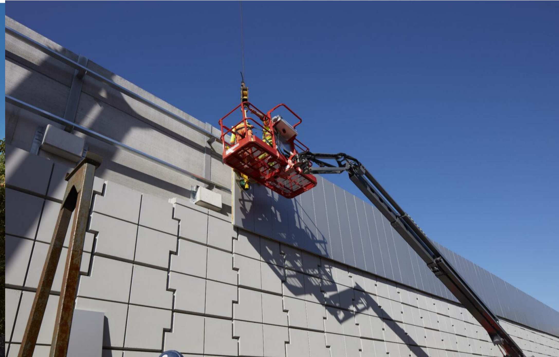
Cladding installation on the Elevated Guideway