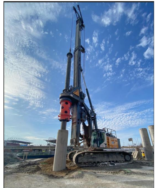
Example of a pile drill rig