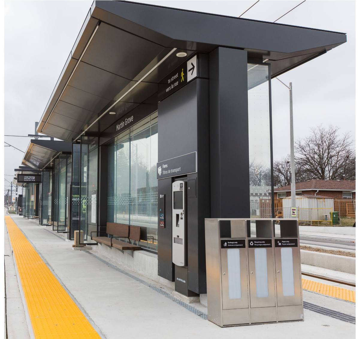
Martin Grove stop platform, west view. 2024.03.28