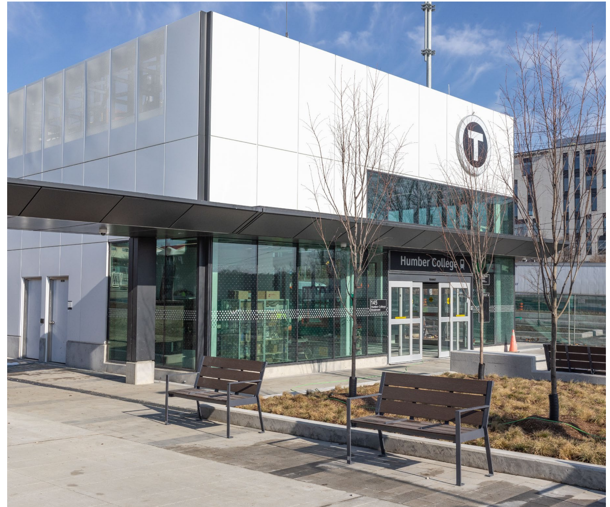
Photo: Humber College station, South building external view. 2023.11.30