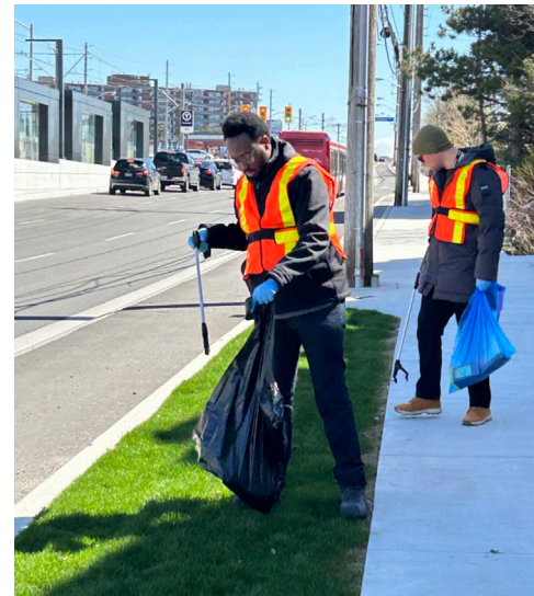
Photo: Litter clean-up near Pearldale Avenue.