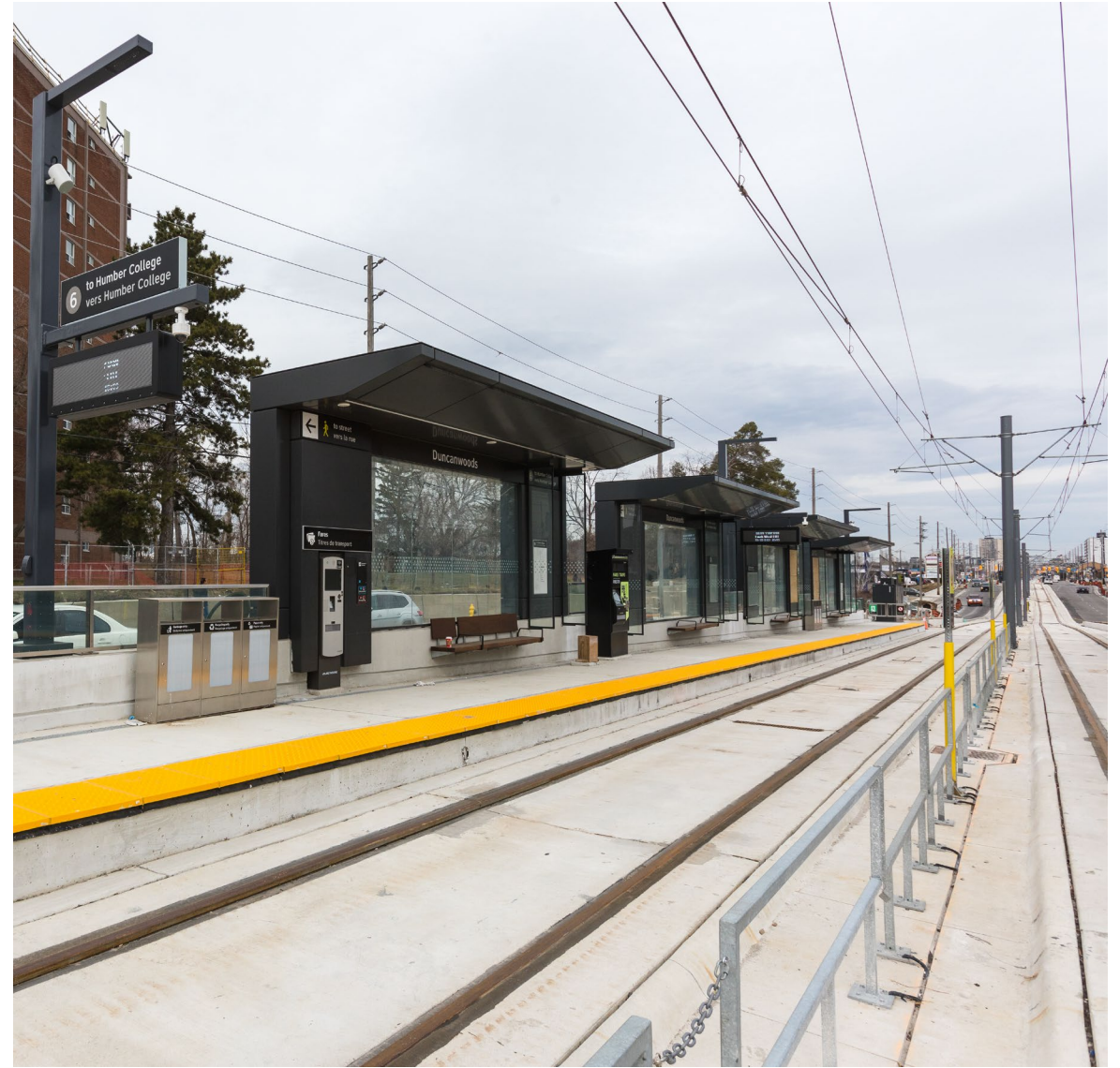
Photo: Duncanwoods stop westbound platform, northeast view. 2024.03.28