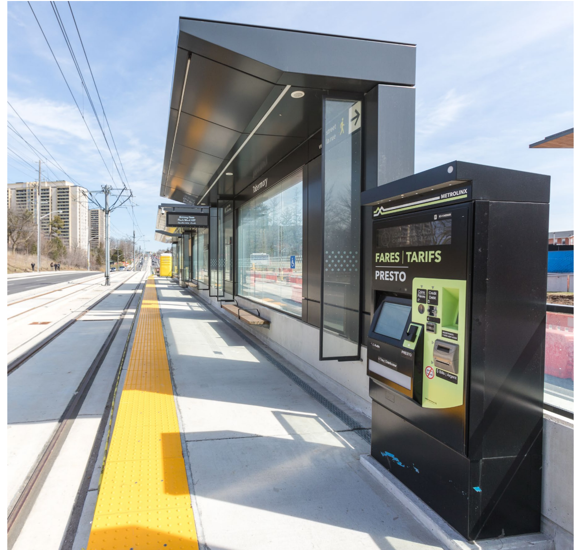
Photo: Tobermory stop eastbound platform, east view 2024.03.28