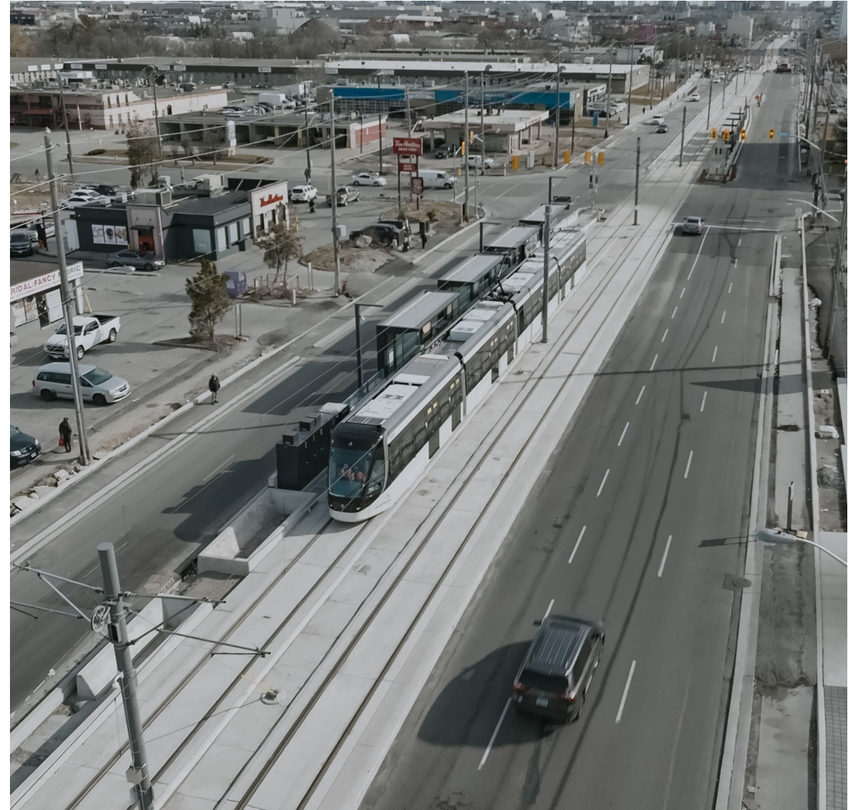
Photo: Milvan Rumike stop westbound platform, aerial northeast view. 2024.03.08