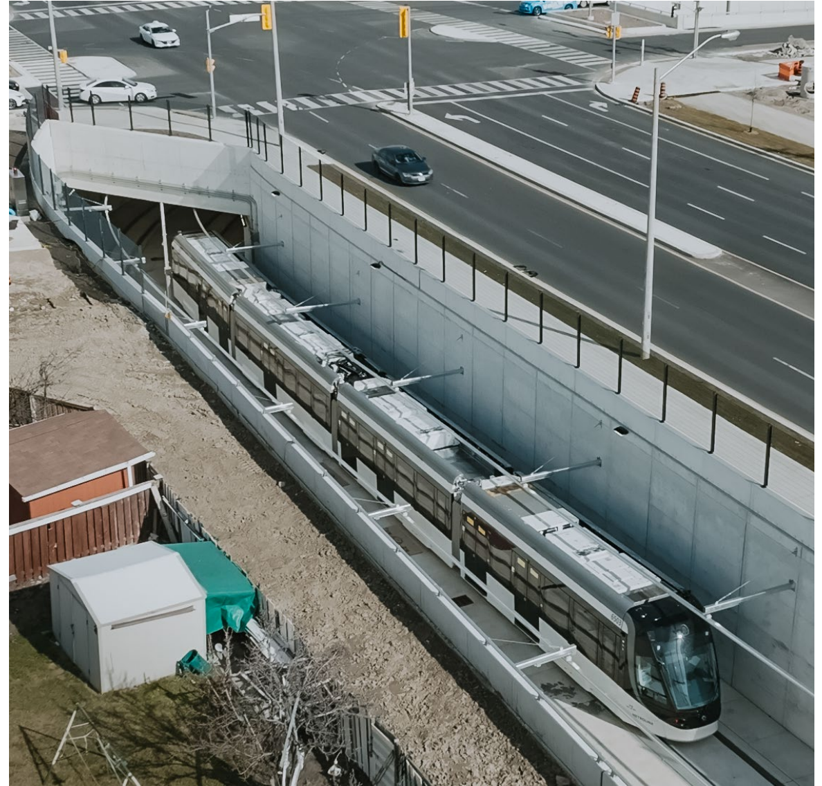
Photo: Finch Avenue West and Highway 27, aerial northeast view. 2024.03.08