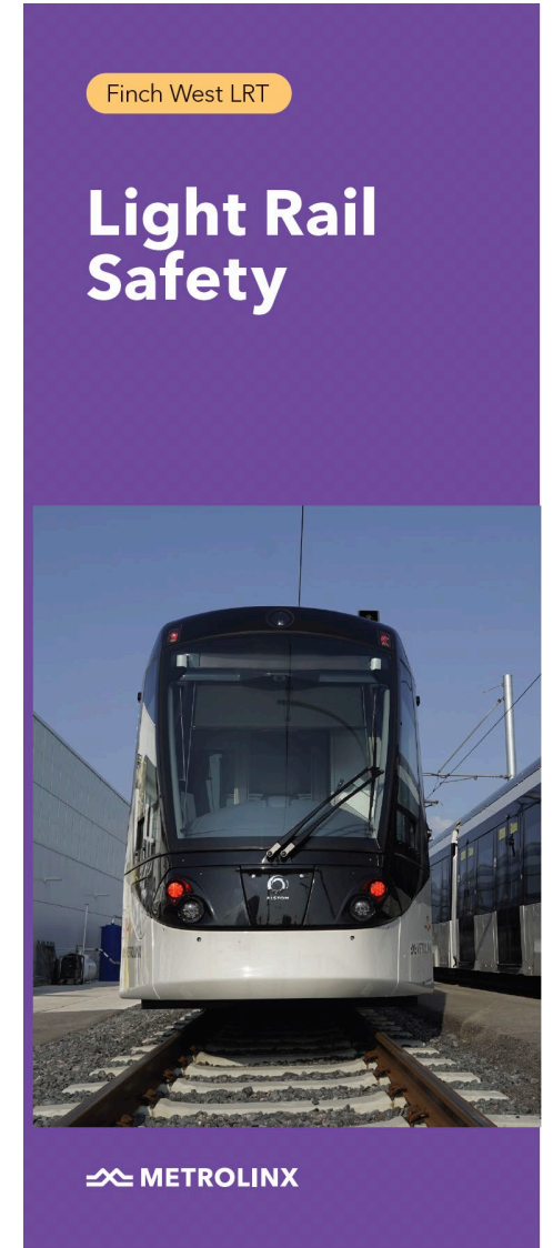
Photo: LRV Guideway Safety Blitz brochure.