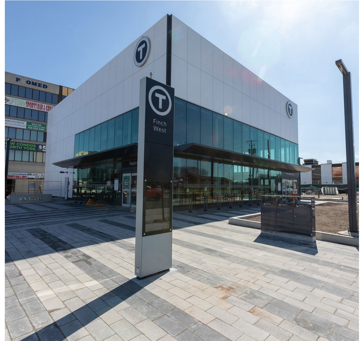
Photo: Finch West station southeast view. 2024.03.28