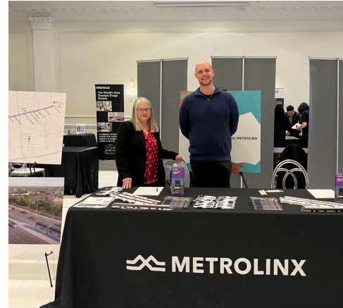
Photo: Emery Village BIA Job Fair 2024.