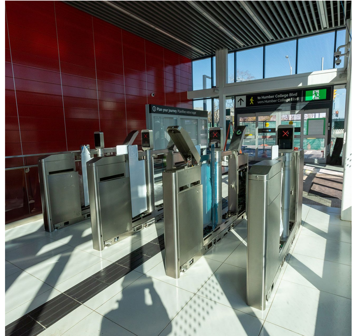
Photo: Humber College station north building interior. 2024.03.28