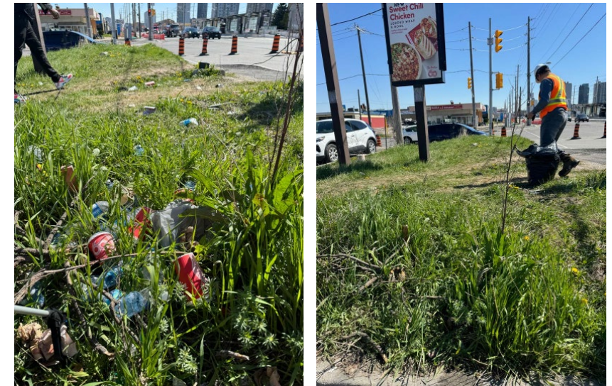
Photo: Before and After litter clean up at Milvan Drive.