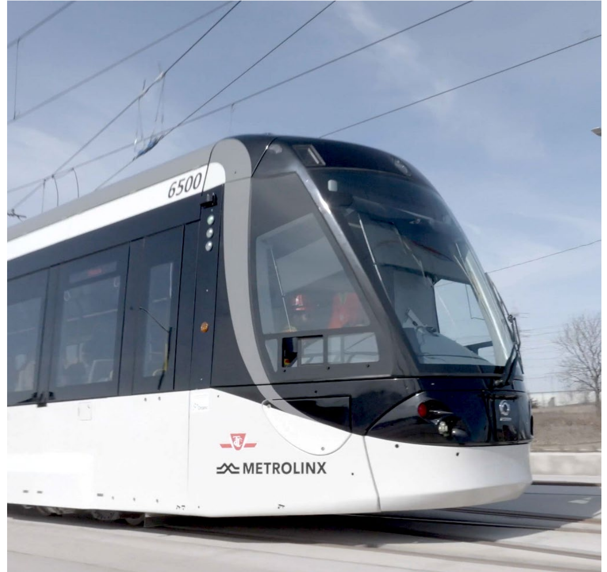
Photo: LRV testing near Finch Ave W and Signet intersection. 2024.03.08