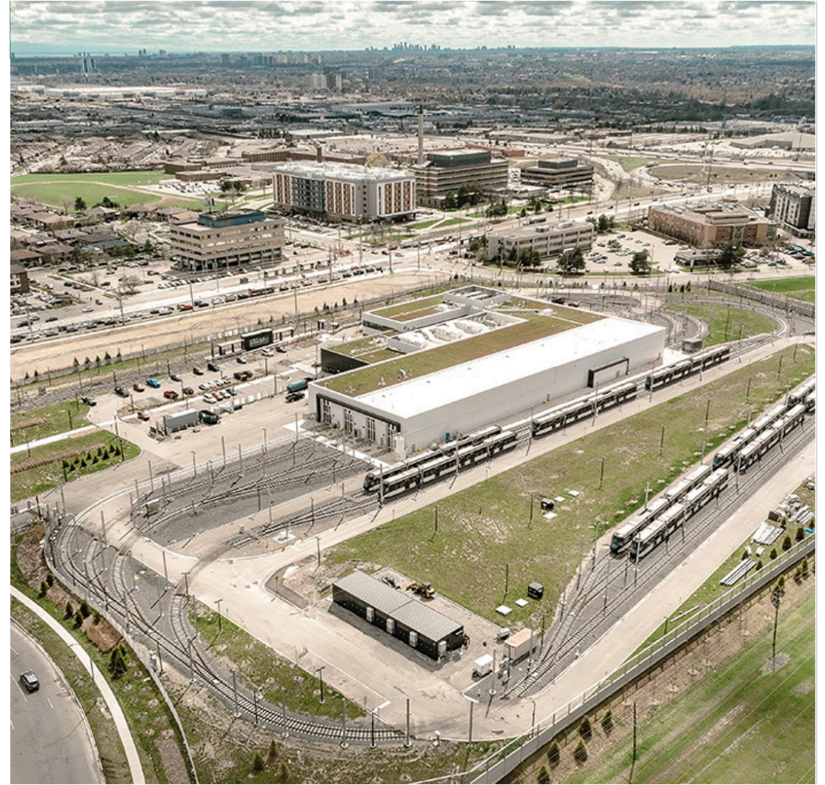
Photo: Maintenance and Storage Facility northeast aerial view. 2024.03.24