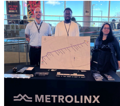
Photo: Humber College Student Orientation Event May 2.