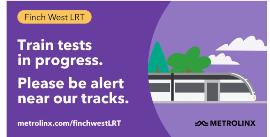
Photo: Q2 LRV Safety Campaign Ad "Train Tests" Emery Village Voice.