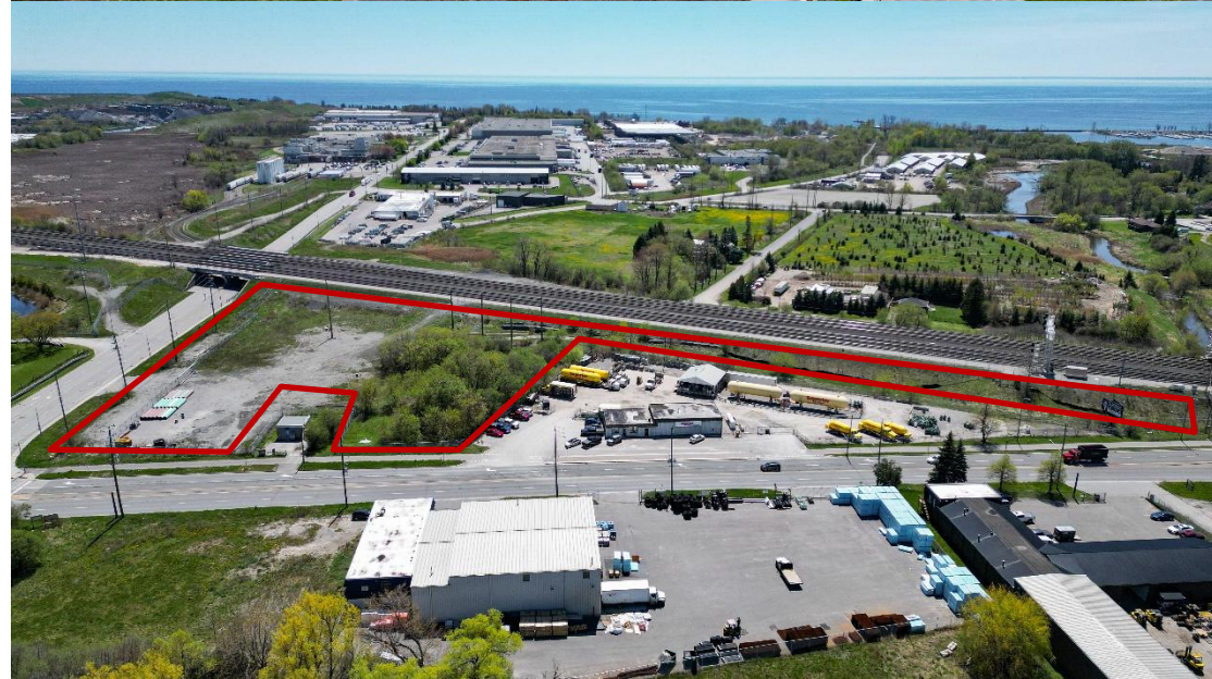
Approximate site outline