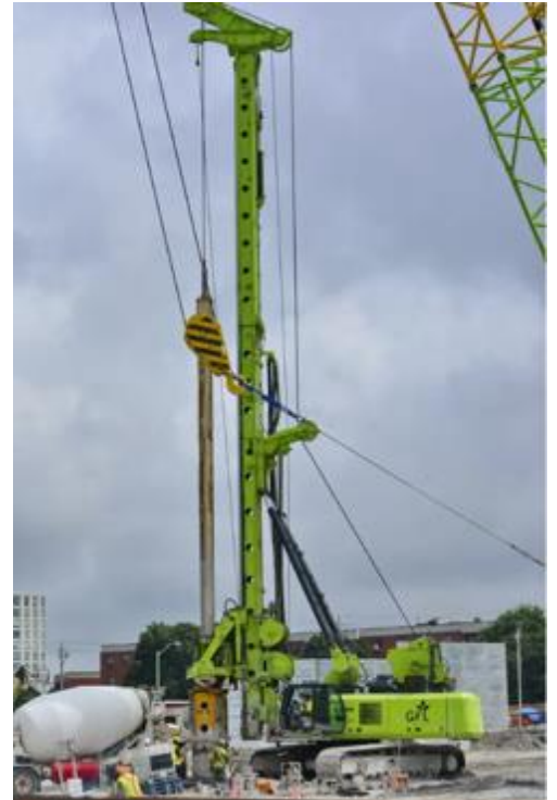
Example of a pile drilling rig