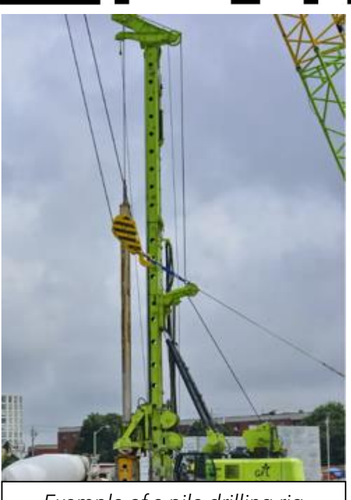
Example of a pile drilling rig