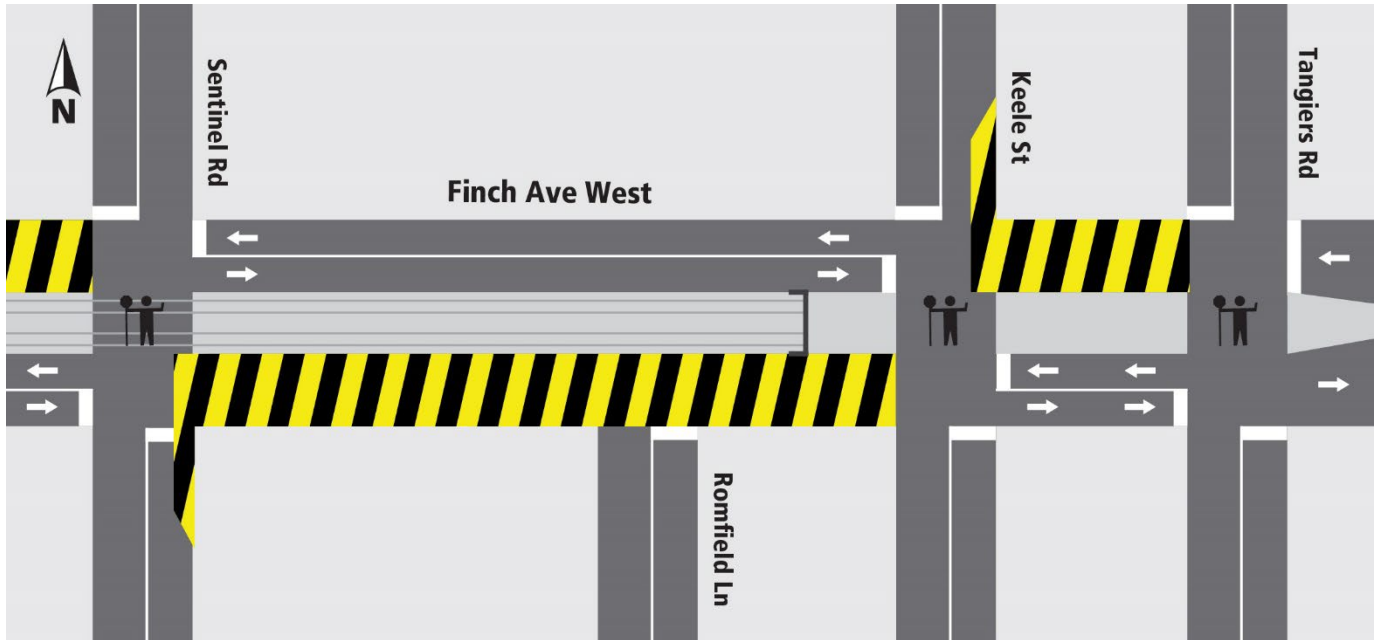
Map 2 Description: Between Sentinel Road and Tangiers Road. Final paving starting June 24, 2024 for four (4) weeks, approximately.