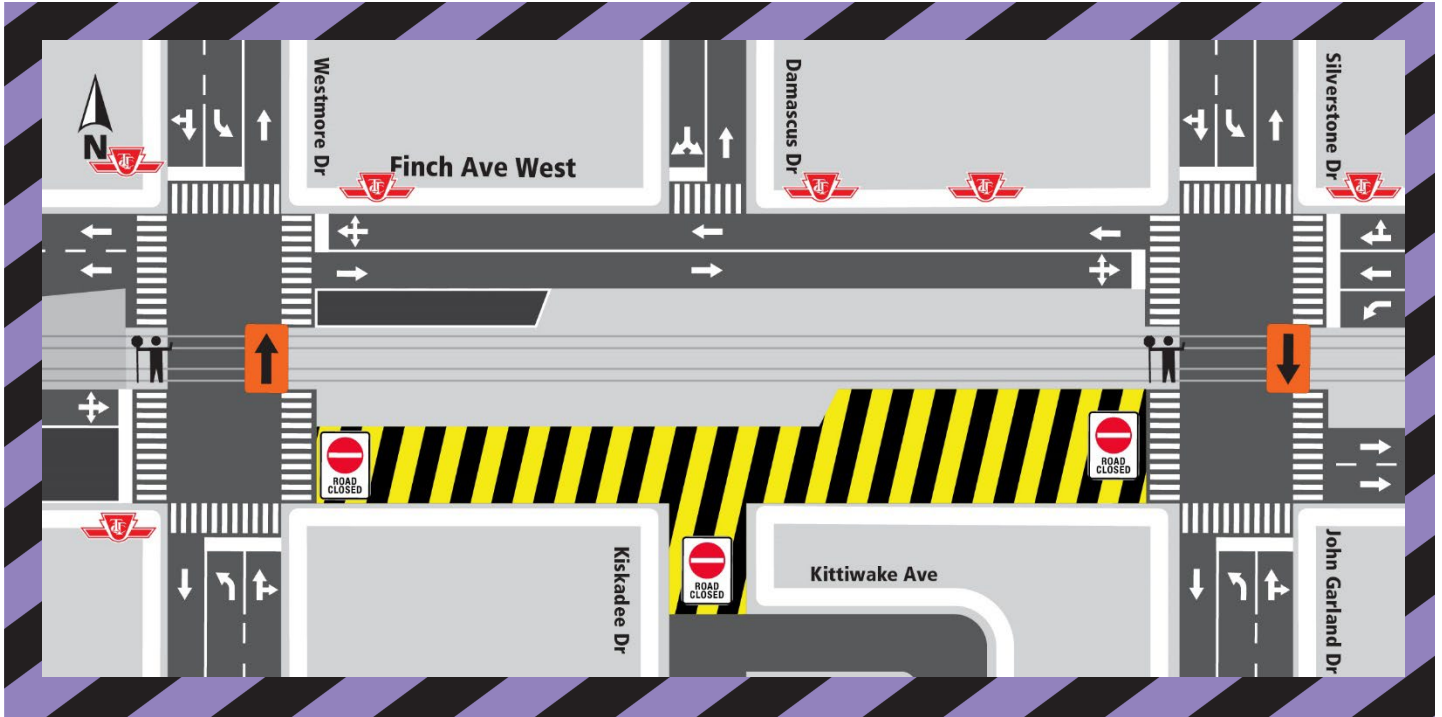
Map 1 Description: Short term closures between Westmore Drive and John Garland Drive for minor road and milling works, starting June 13, 2024 for two (2) days, approximately.