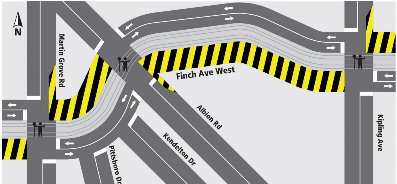
Map 2 Description: Final paving starting June 24, 2024 for four (4) weeks, approximately.