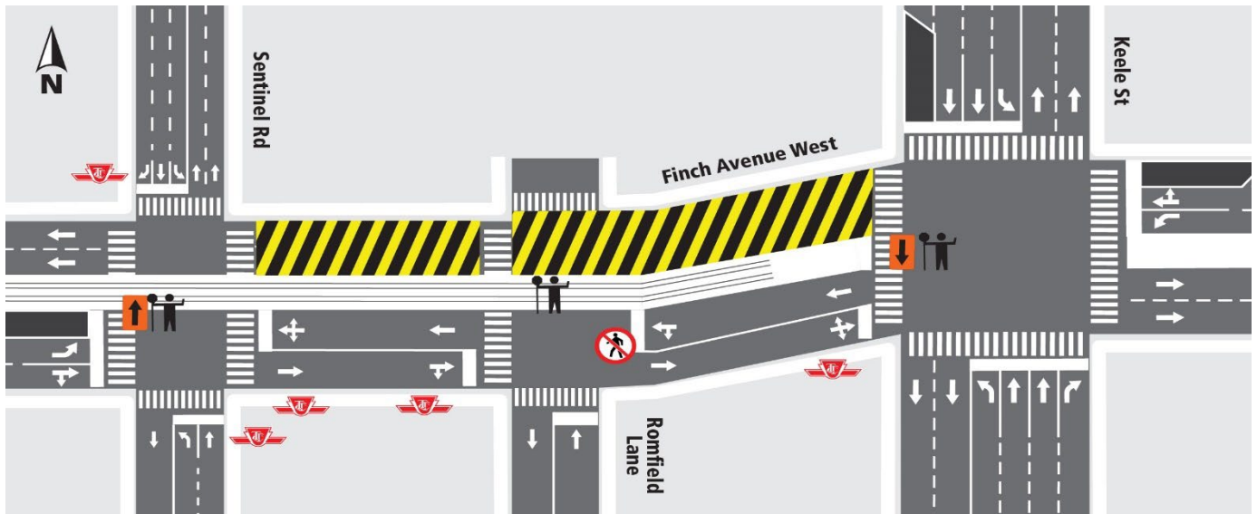
Map 2 Description: Sentinel Road to Keele Street. Milling works starting June 22, 2024, and will last for one (1) day, approximately.