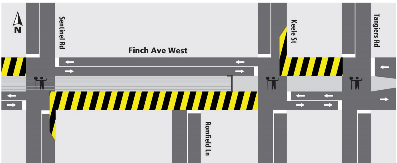
Map 2 Description: Between Sentinel Road and Tangiers Road. Final paving starting June 24, 2024 for four (4) weeks, approximately.