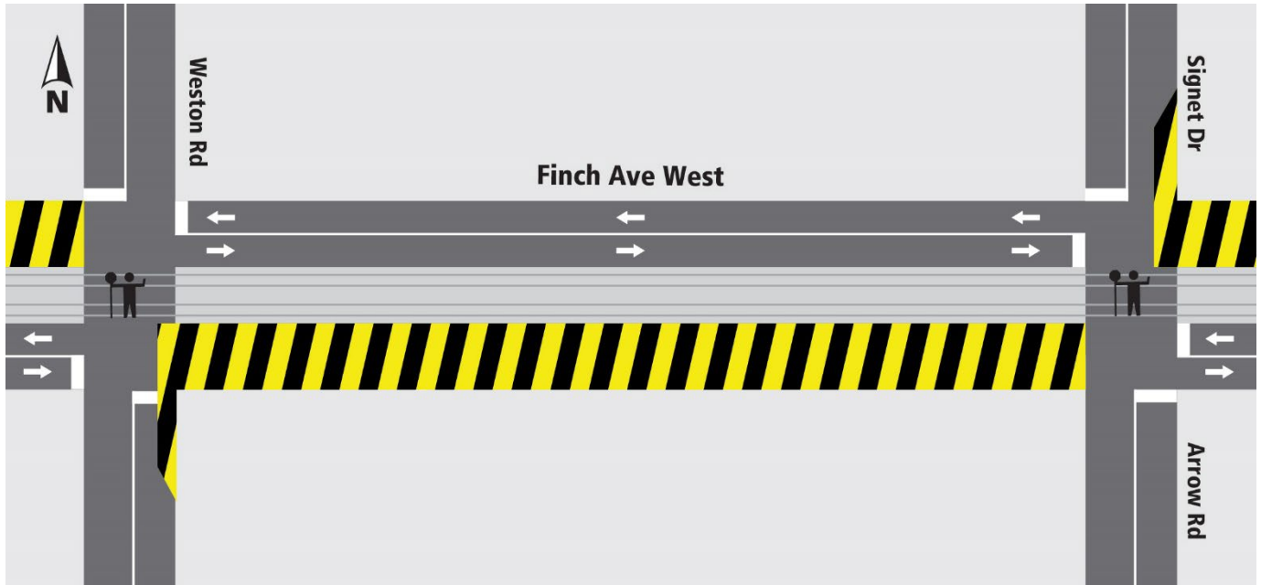
Map 2 Description: Weston Road to Signet Drive, Arrow Road. Final paving starting June 29, 2024, for four (4) weeks, approximately.