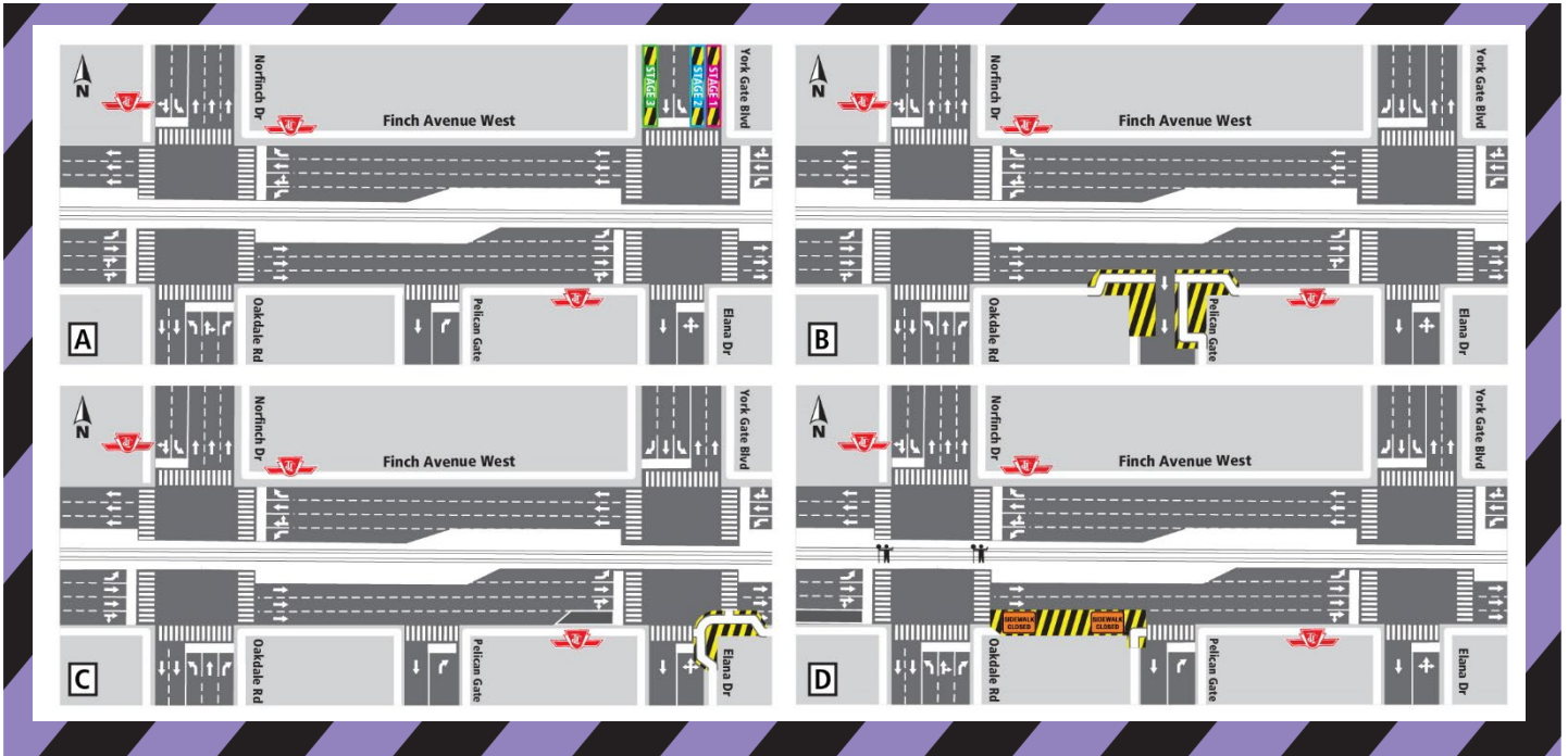
Map 1 Description: Oakdale Road to York Gate Boulevard, Elana Drive and Finch Avenue West.

Staging A: Minor utilities works started June 5, 2024, and will last for two (2) weeks, approx. Lane closures will be implemented one at a time in Stages 1, 2 and 3;