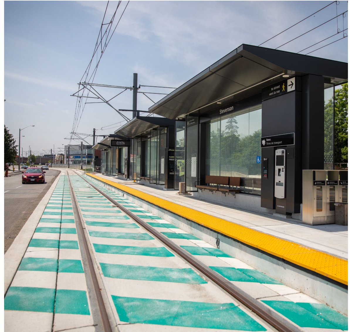
Photo: Stevenson platform stop, west view. 2024.05.21