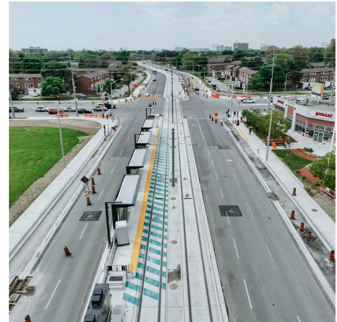
Photo: Albion stop, west view aerial. 2024.05.21