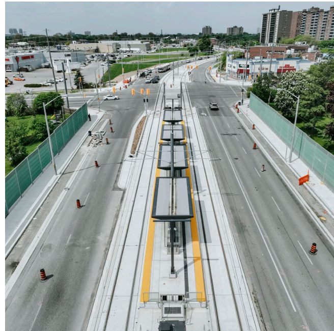
Kipling stop, west view aerial. 2024.05.21