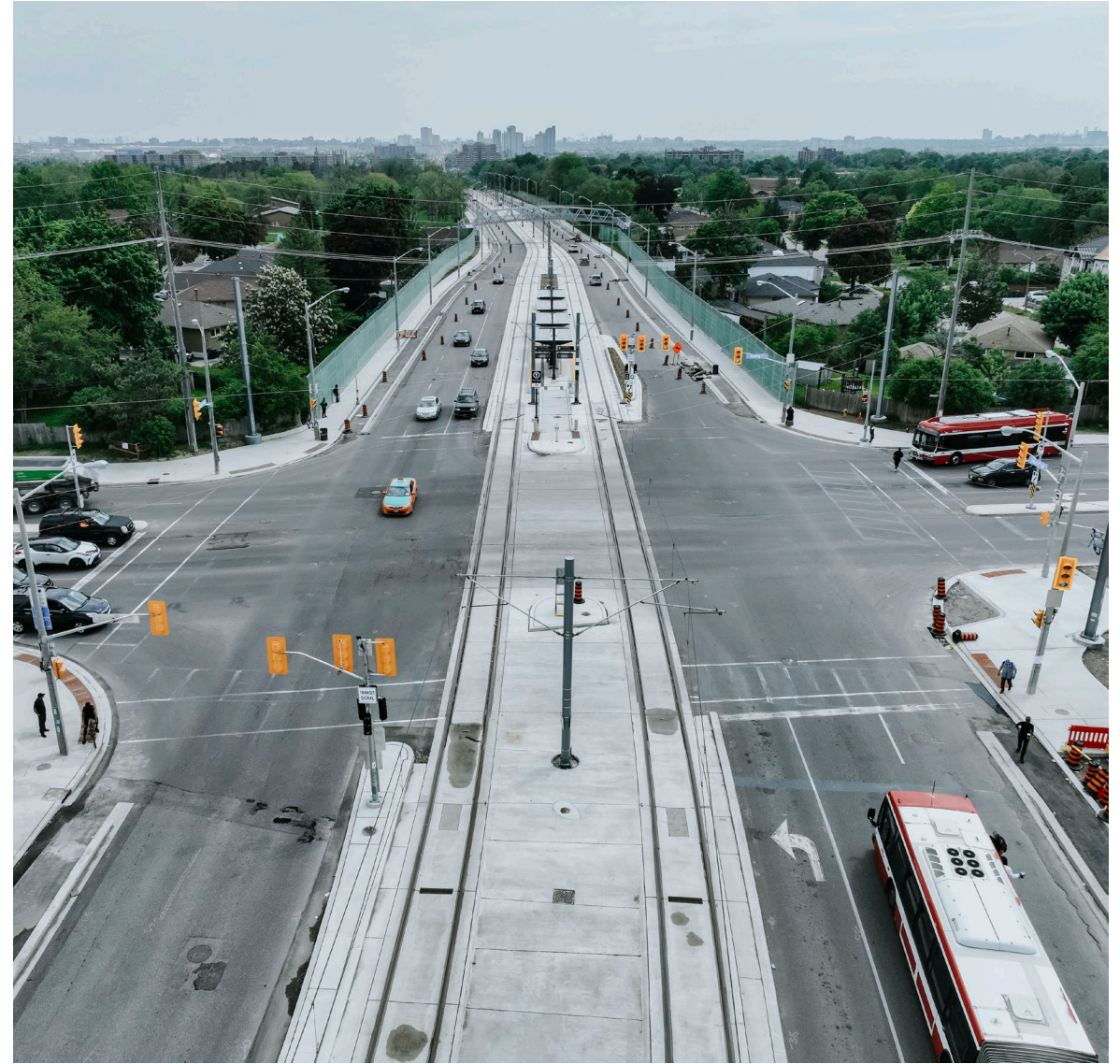
Photo: Finch Ave West and Kipling Ave, aerial west view. 2024.05.21