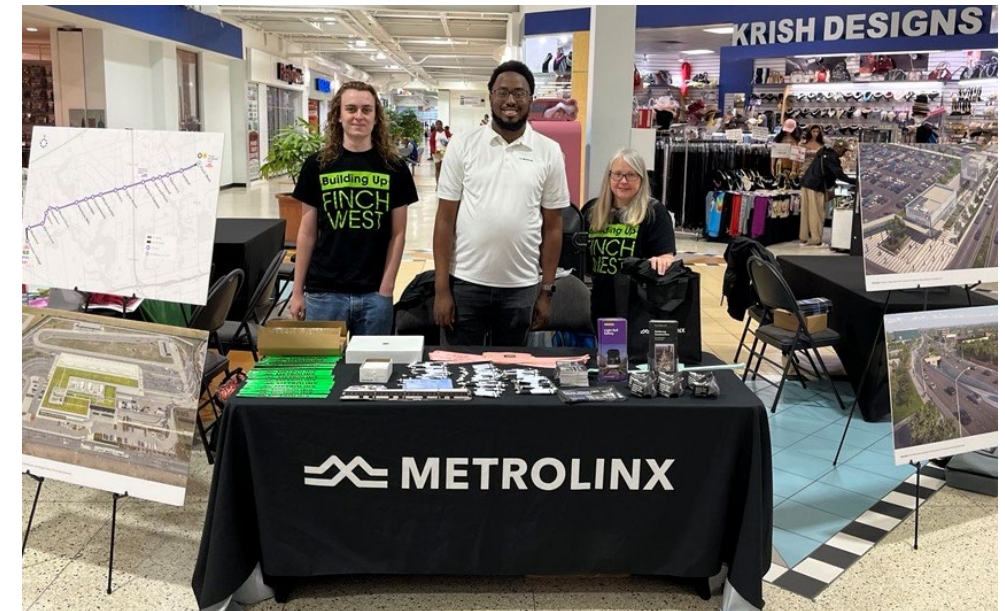
Photo: Bike Clinic at Jane Finch Mall.