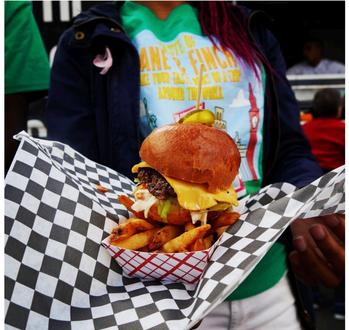
Photo: Taste and Sound of Jane and Finch 2019.