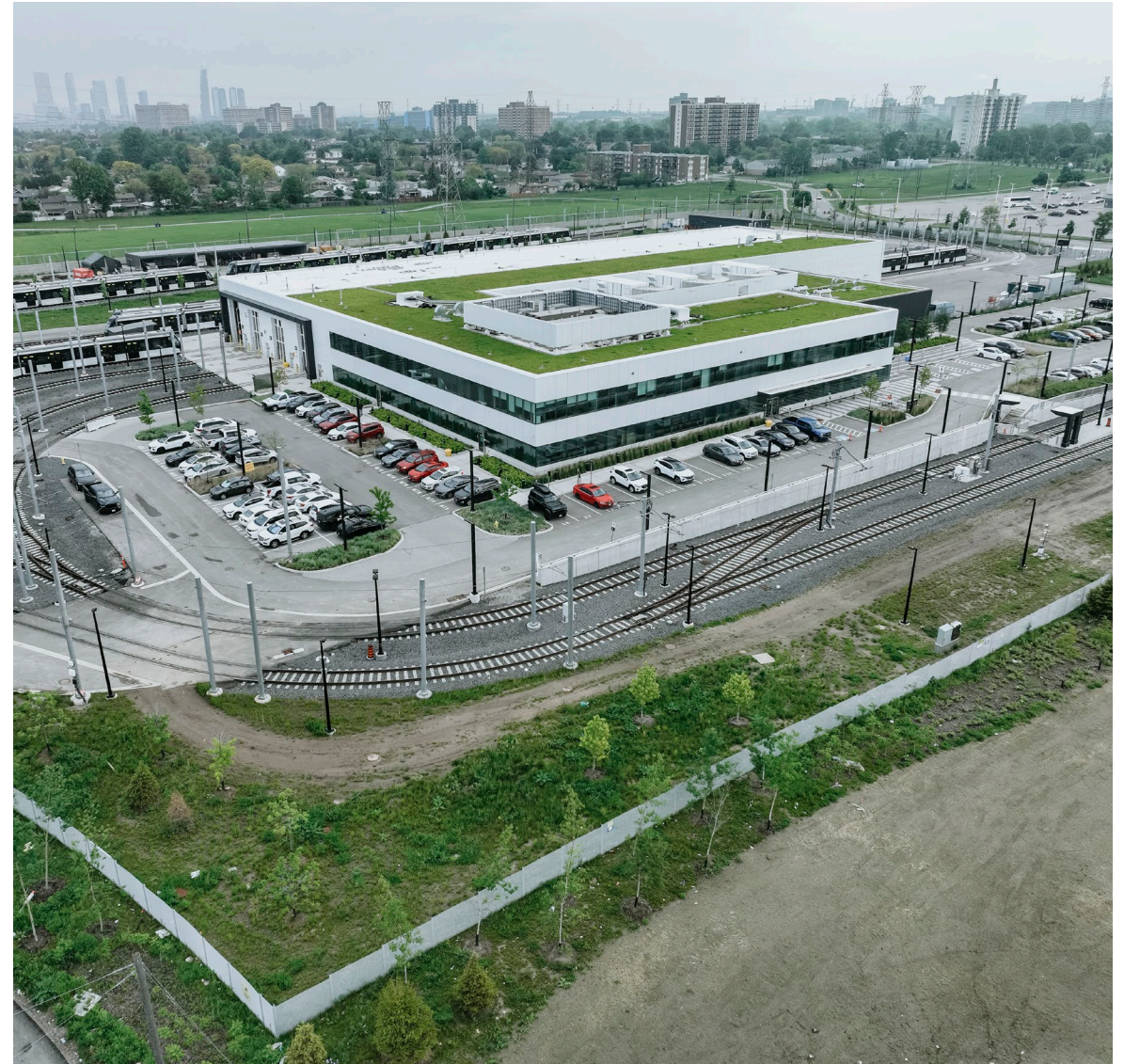
Photo: Maintenance and Storage Facility , northeast arial view. 2024.05.21