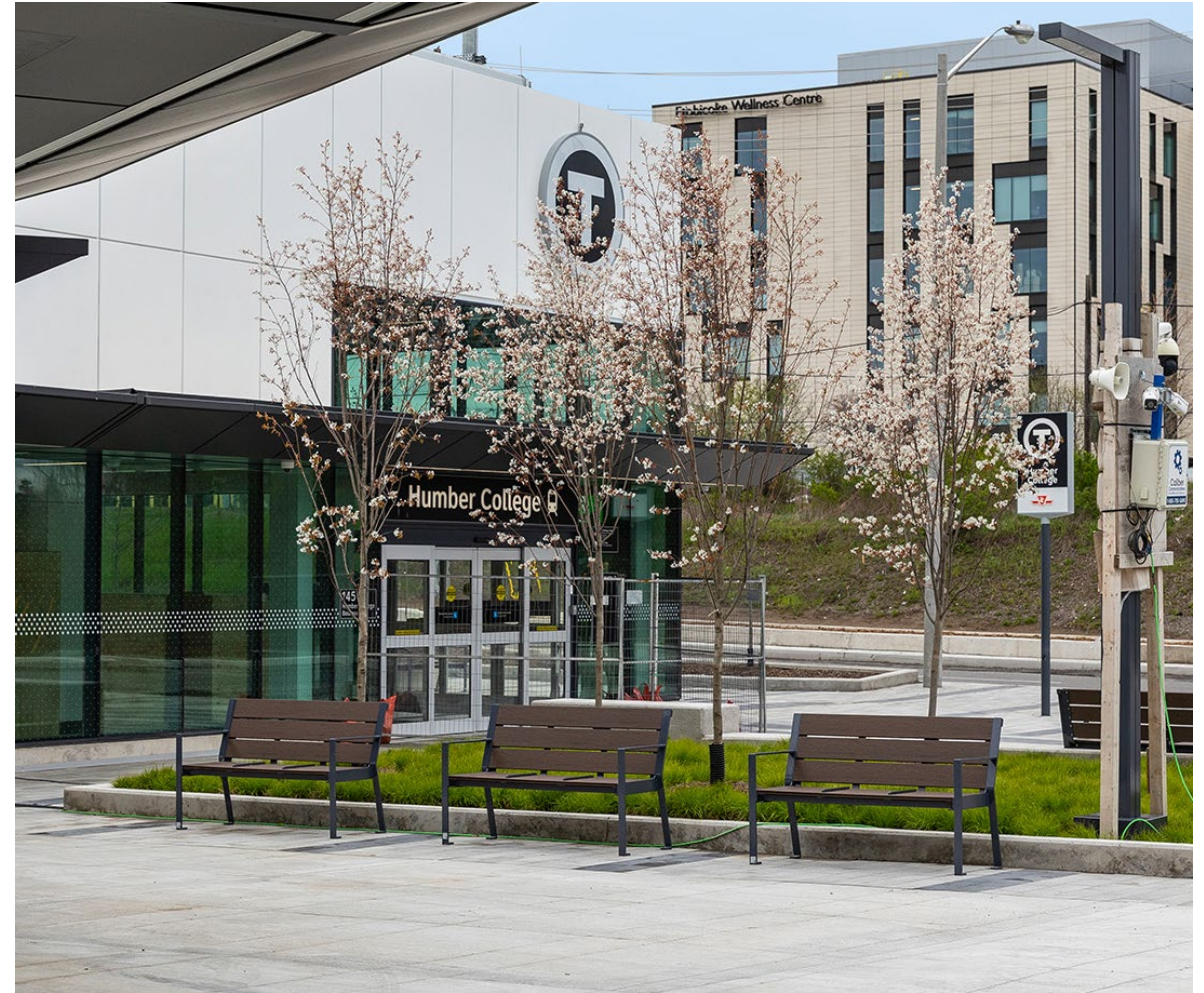
Photo: Humber College station, South building external view. 2024.04.27