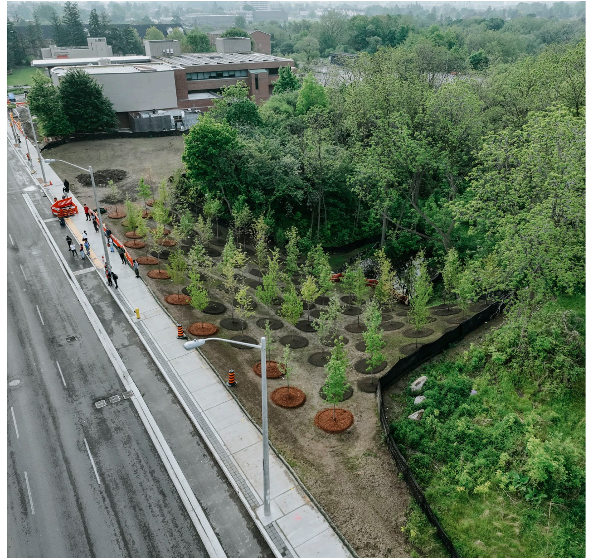
Photo: Trees planting east of Tobermory Dr., southeast view aerial 2024.05.21