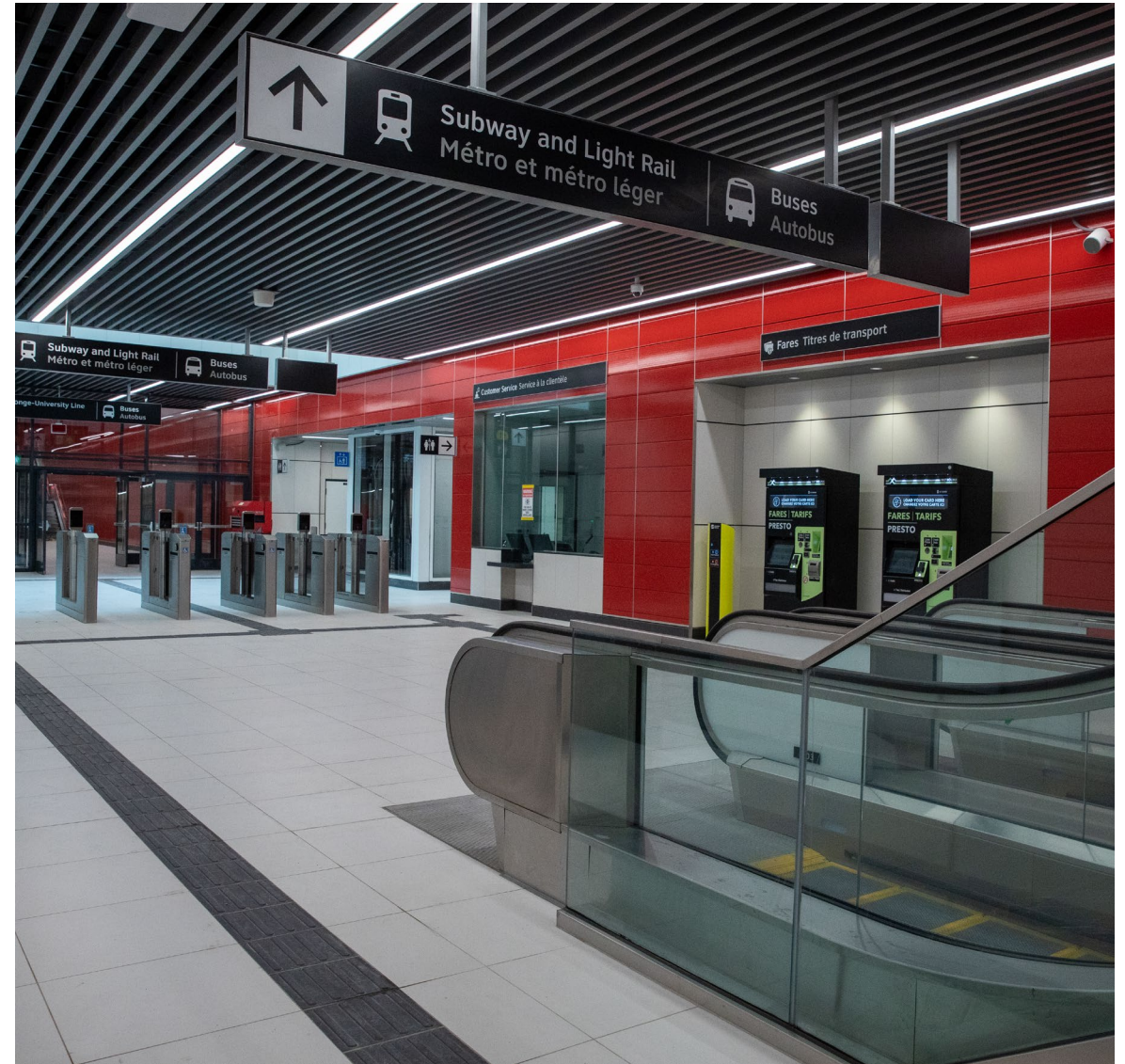
Photo: Finch West station southeast view. 2024.03.28