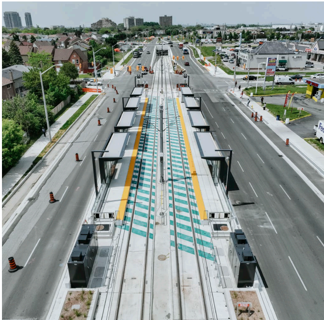
Photo: Westmore stop, west view aerial. 2024.05.21