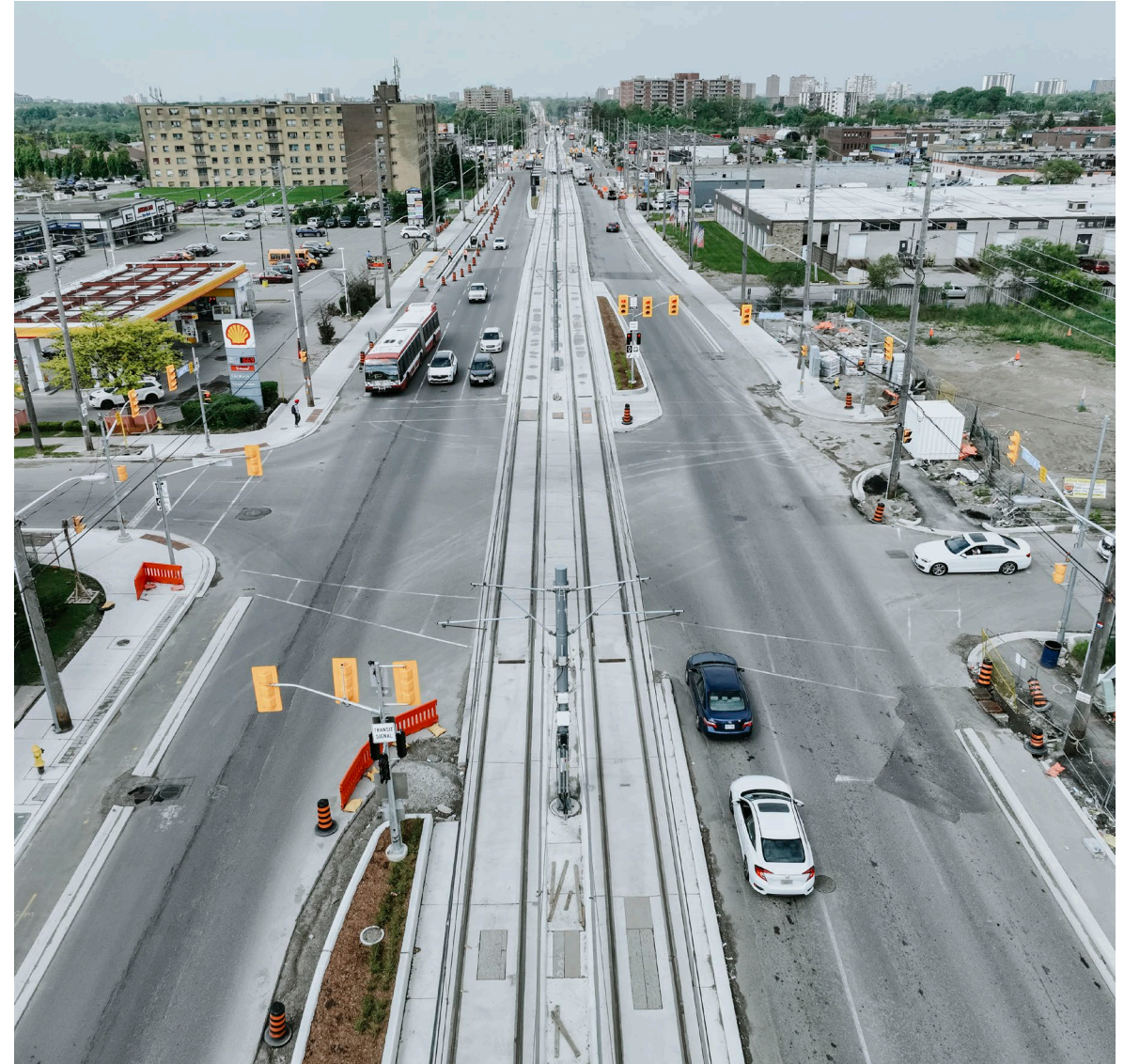
Photo: Finch Ave West and Jayzel Dr, aerial west view. 2024.05.21