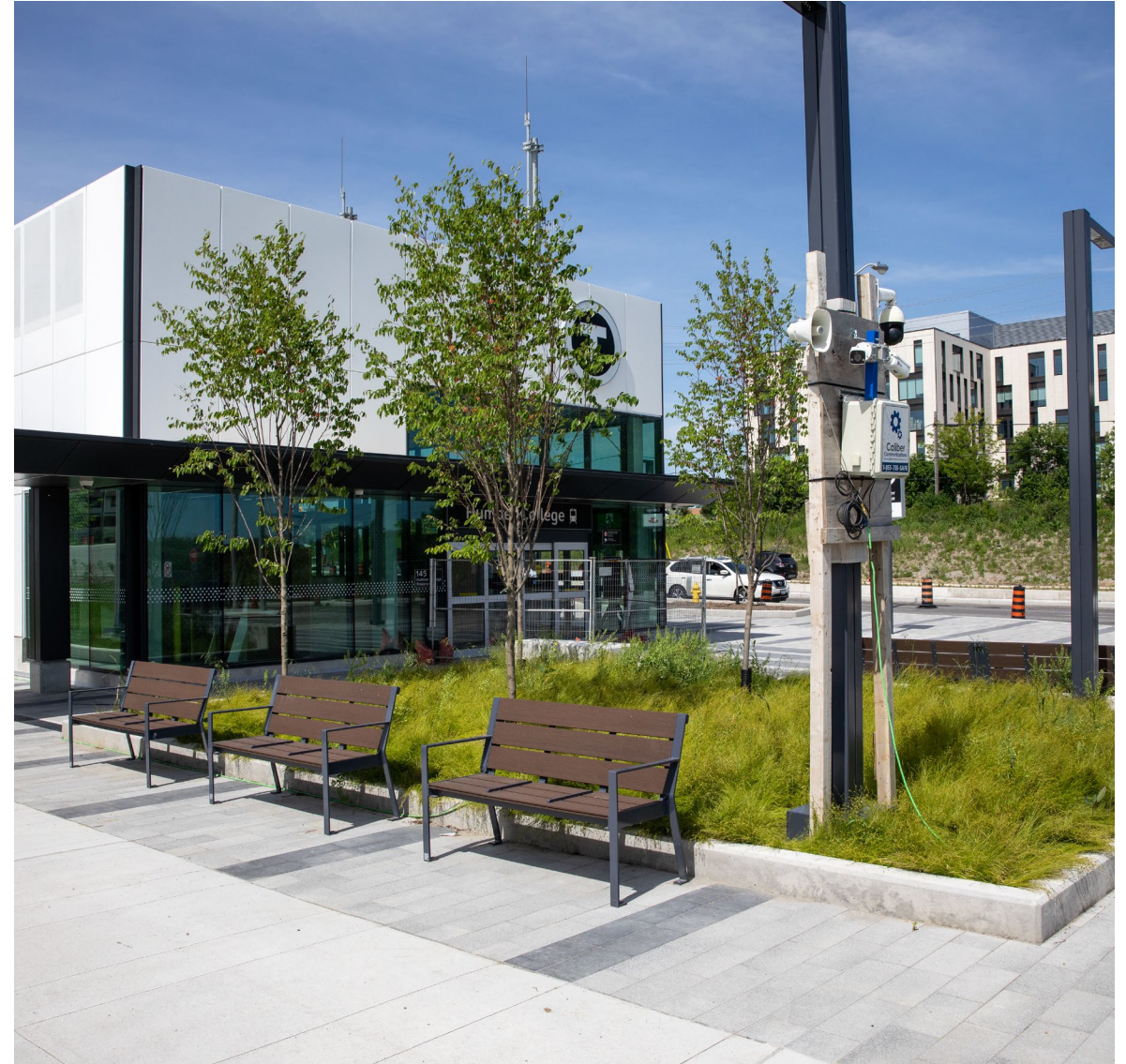
Photo: Humber College station south building exterior. 2024.05.21