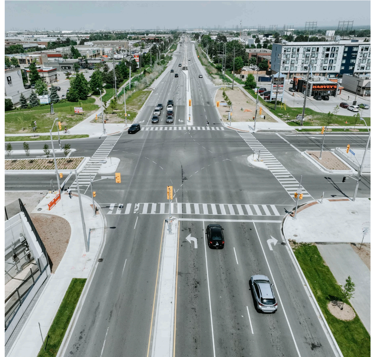
Photo: Highway 27 and Finch Avenue West, aerial north view. 2024.05.21