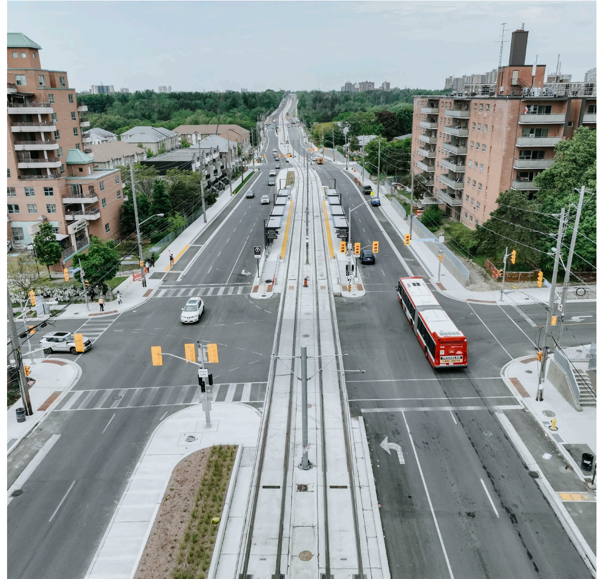
Photo: Finch Ave West and Pearldale Ave, aerial west view. 2024.05.21