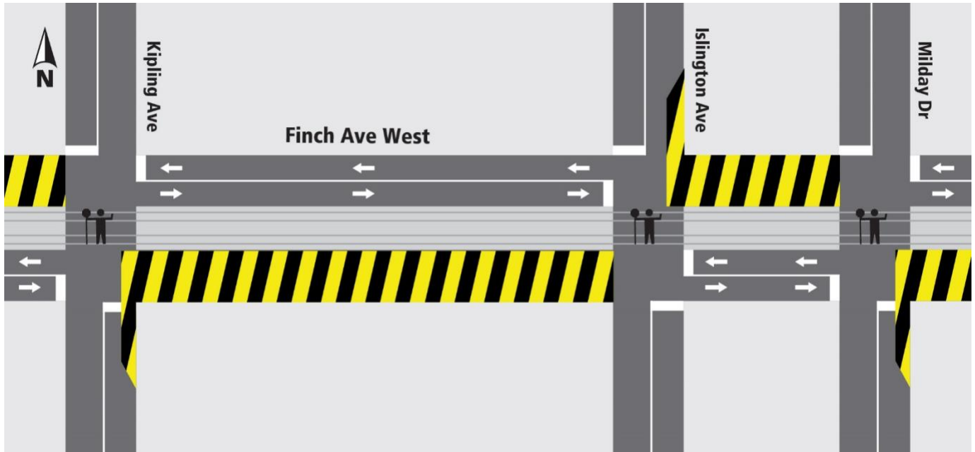
Map 2 Description: Final Paving starting June 24, 2024 for four (4) weeks, approximately.