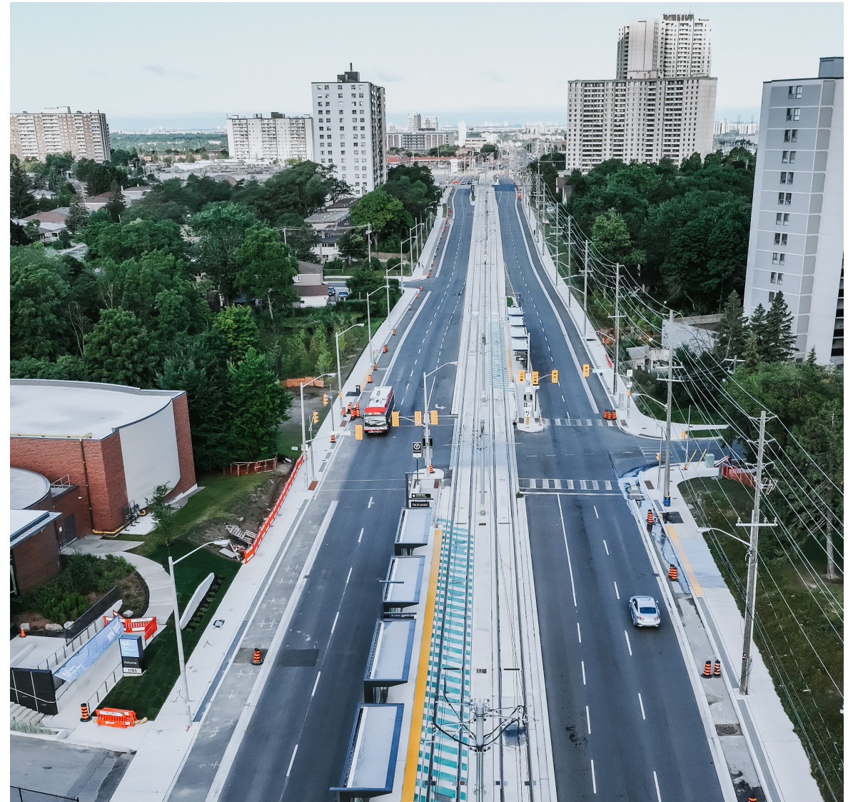
Photo: Finch West Avenue and Tobermory Drive. 2024.06.22