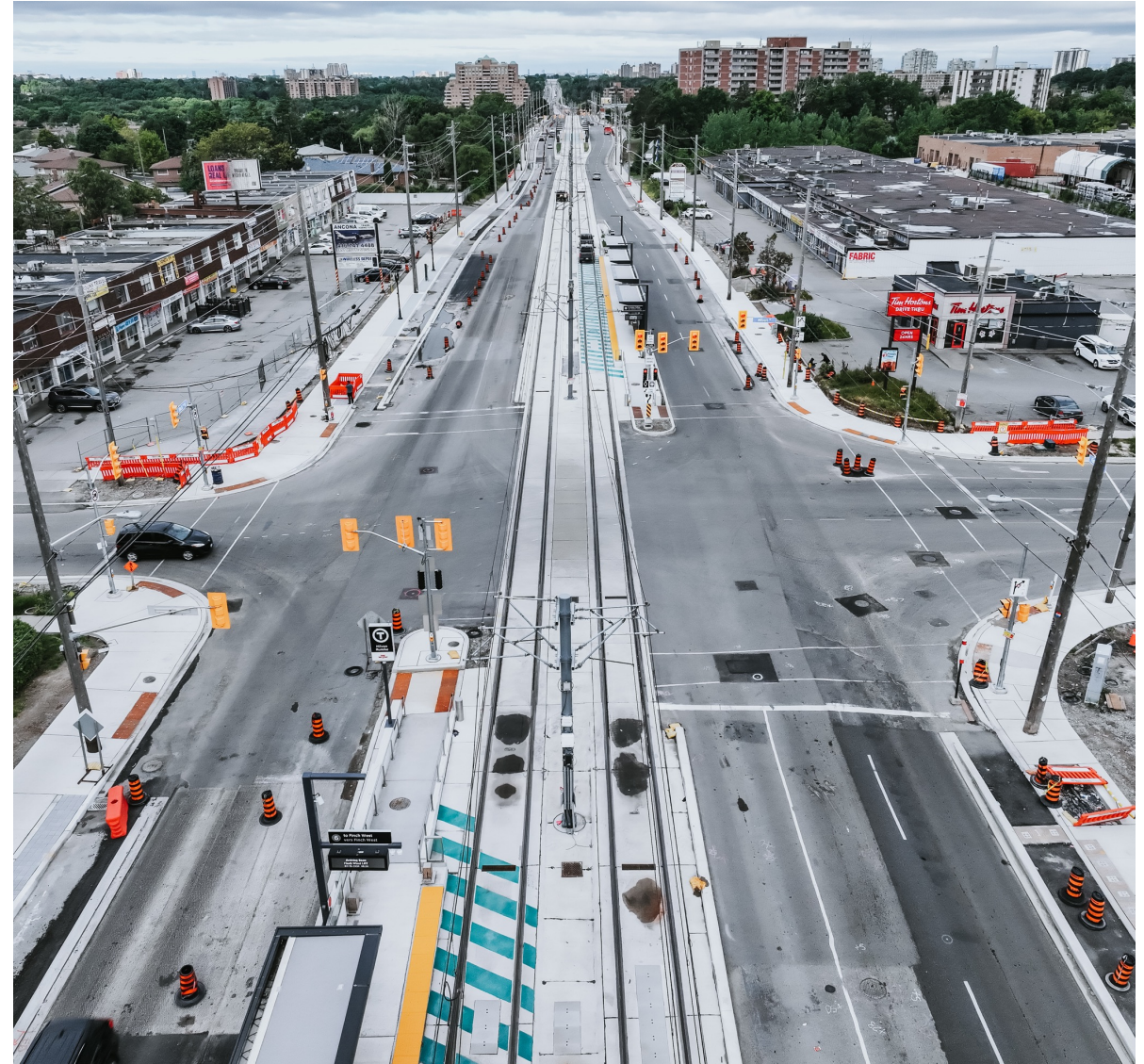
Finch Avenue West and Milvan Drive, aerial view west. 2024.06.22