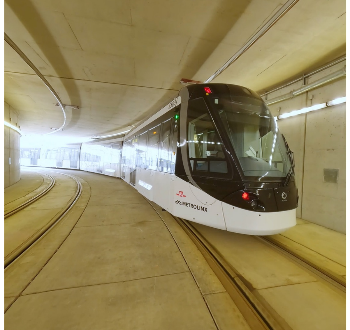
Photo: A Light Rail Vehicle travels through the Humber College portal. 2024.03.08