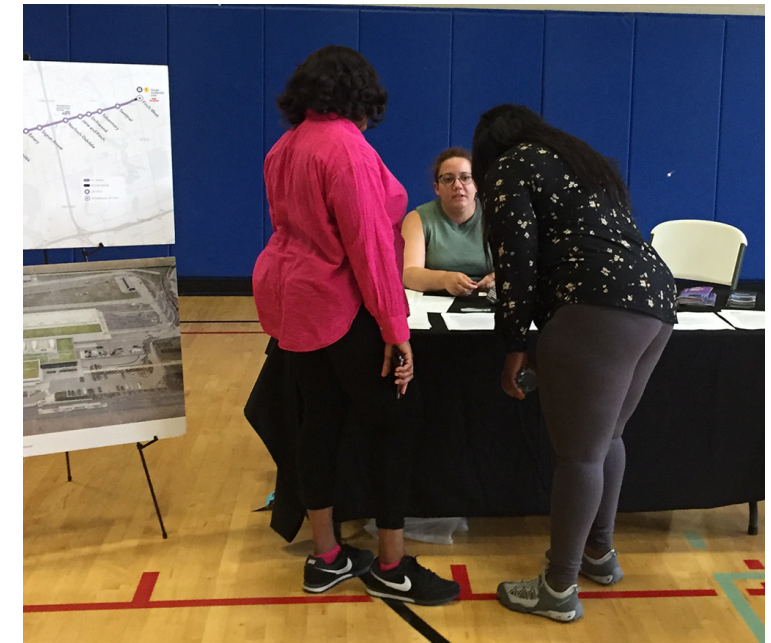
Photo: Rexdale Community Hub Job Fair.