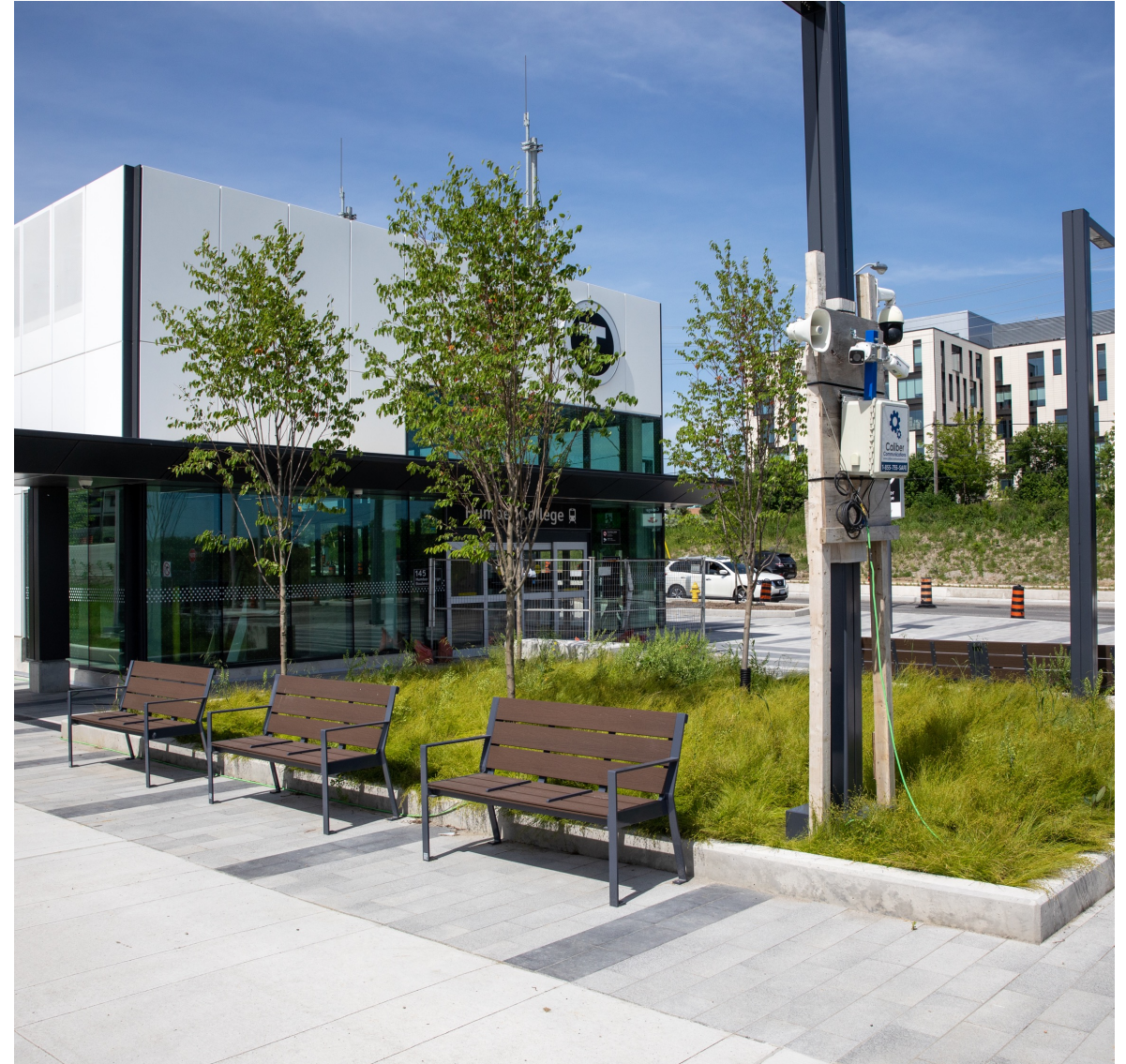
Photo: Humber College station exterior south building. 2024.05.21