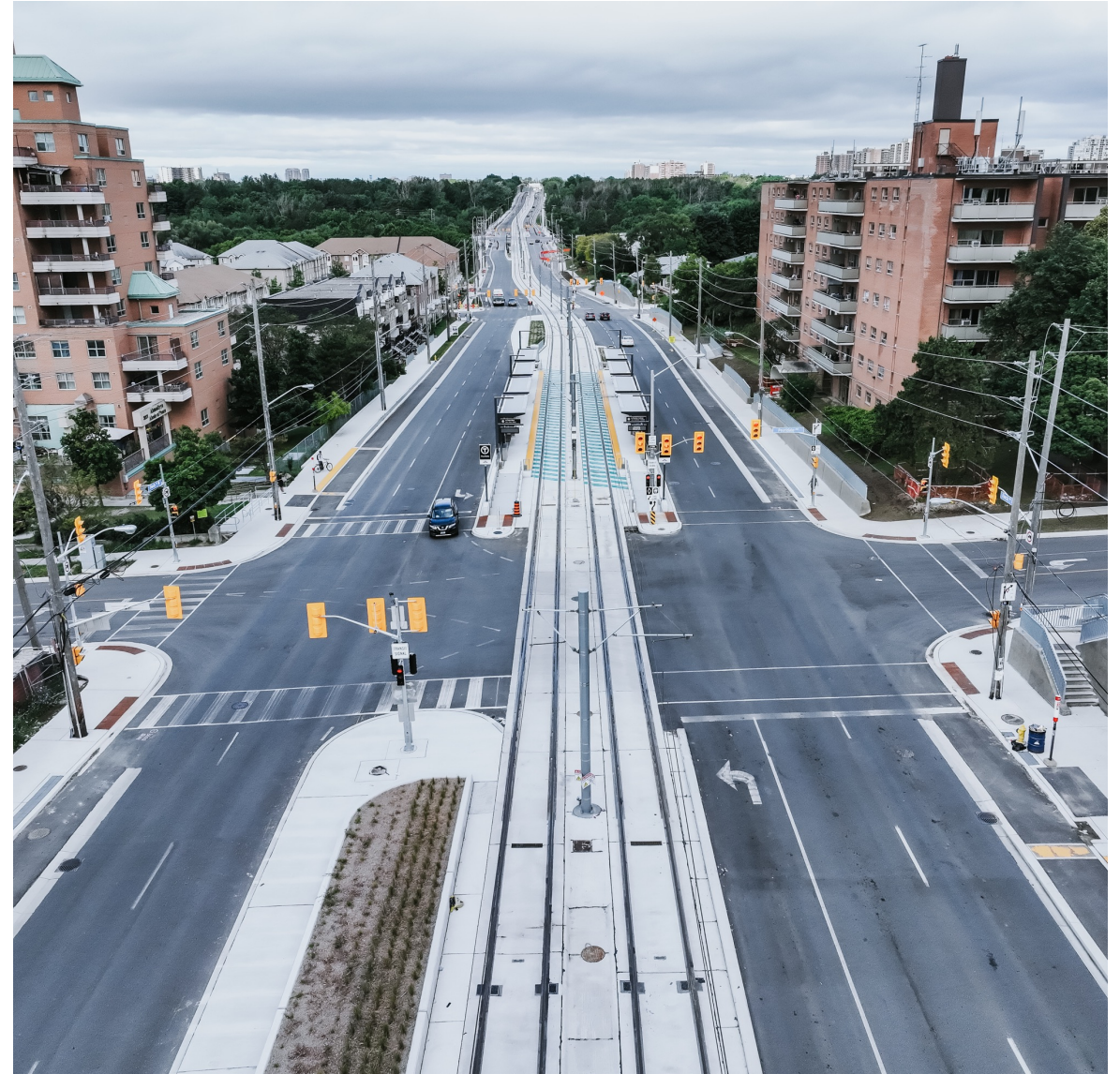
Photo: Finch Avenue West and Pearldale Avenue, aerial view west. 2024.06.22