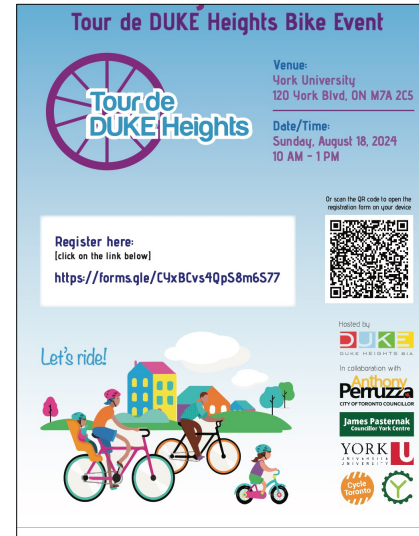
Photo: Tour de Duke Bike Event.