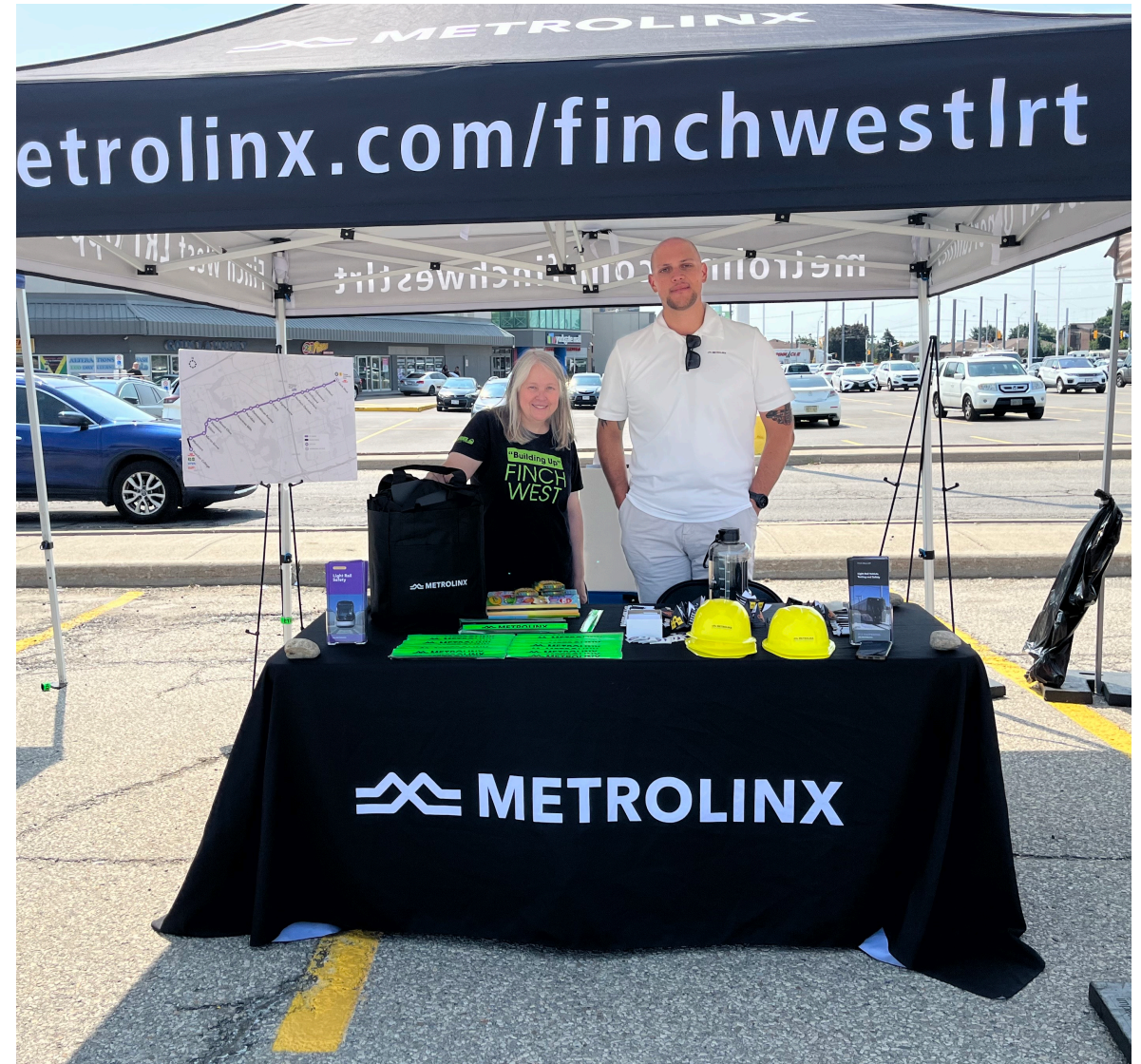
Photo: Metrolinx and Mosaic at the 'Tastes and Sounds' of Jane and Finch community event.