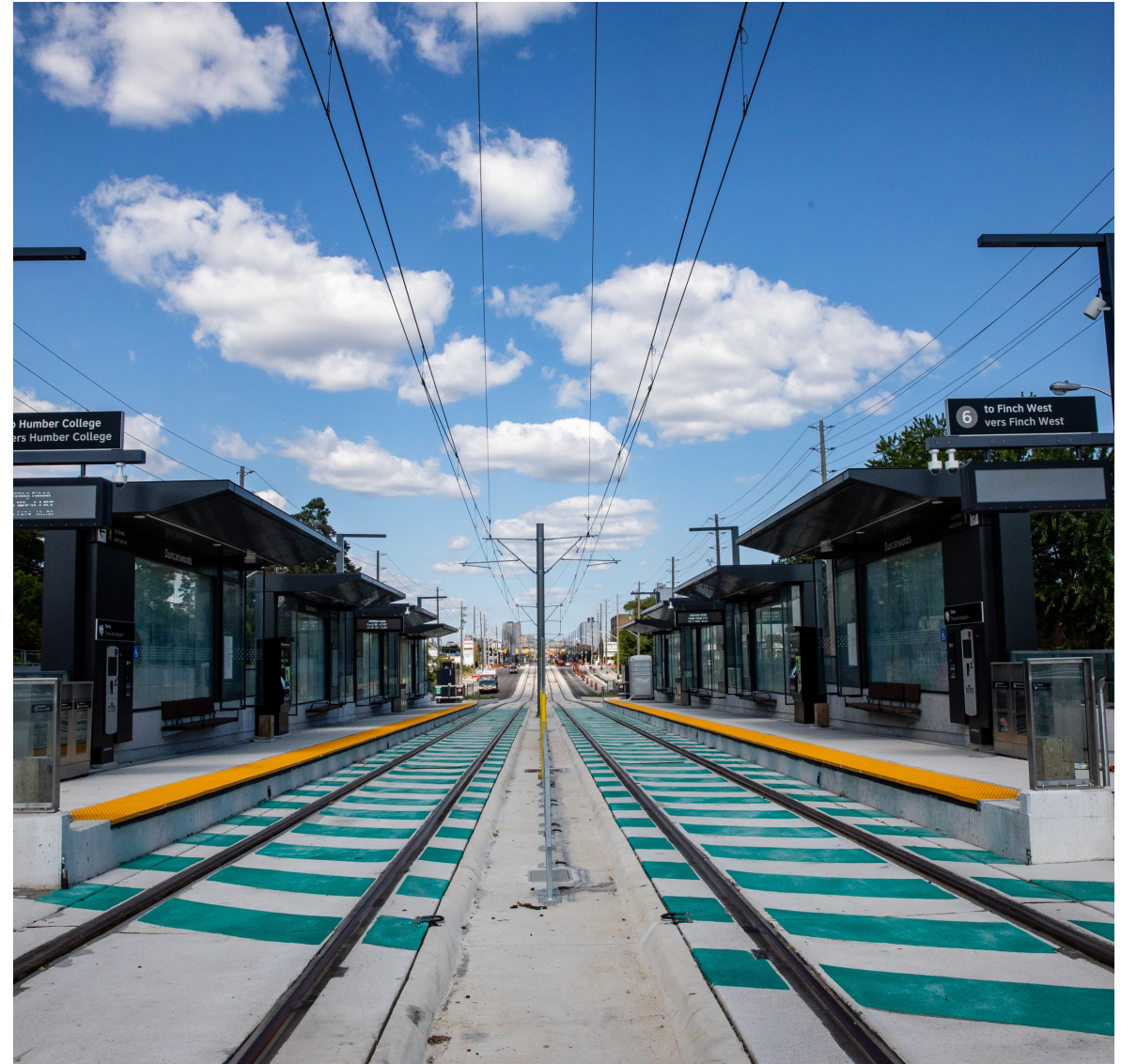
Photo: Duncanwoods stop, west view. 2024.06.22