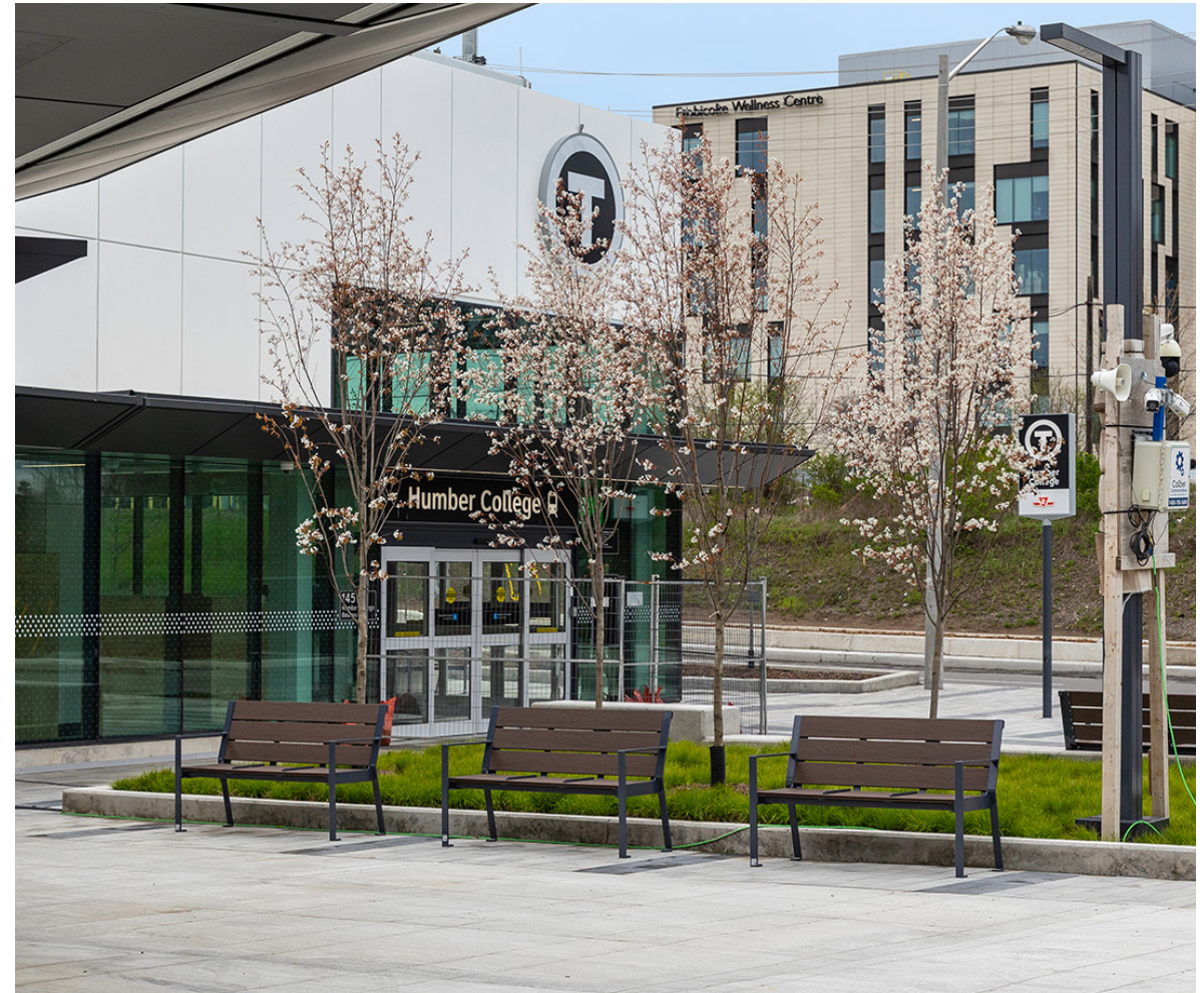
Photo: Humber College station exterior south building. 2024.04.27