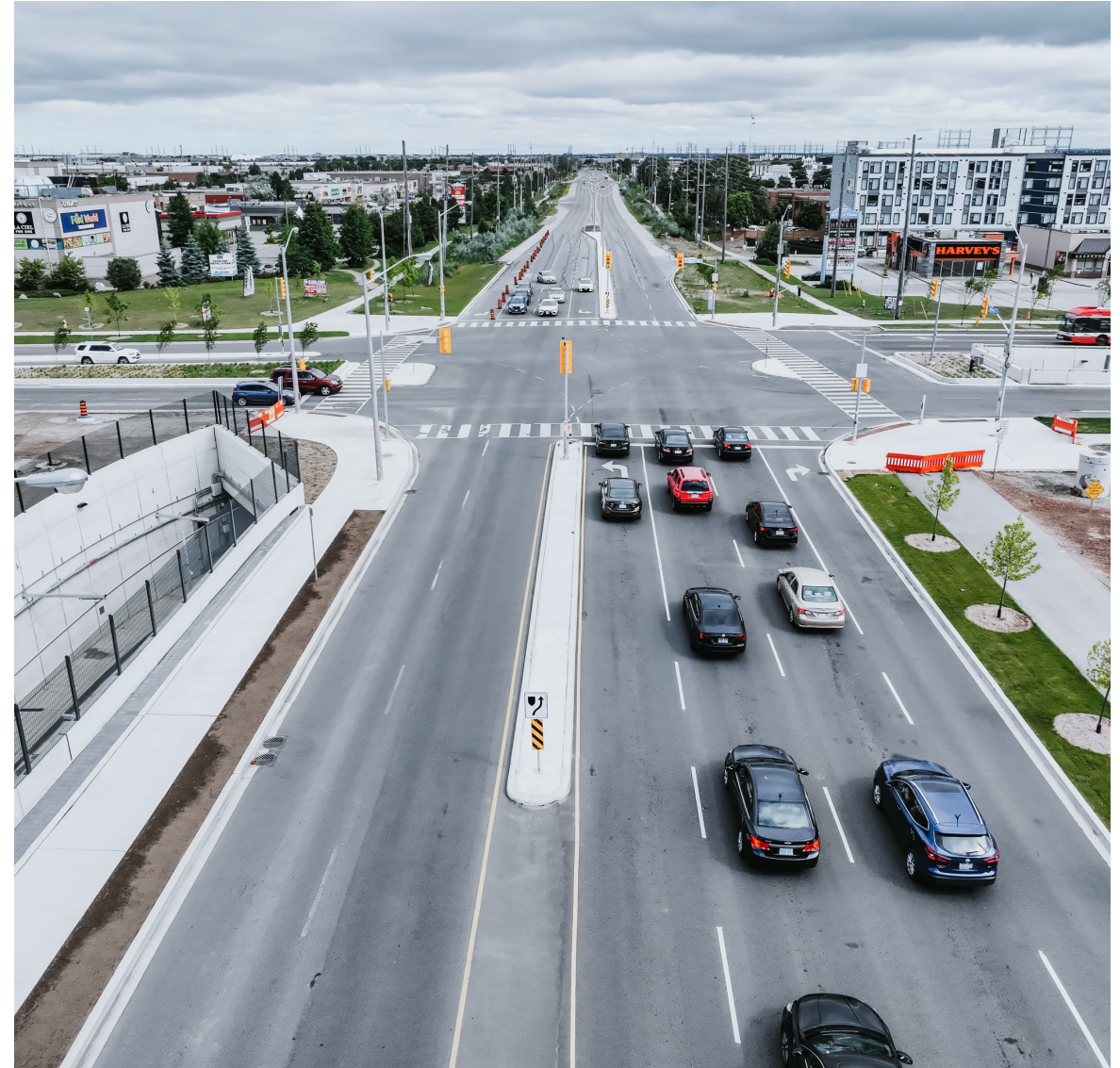
Photo: Highway 27 and Finch Avenue West, aerial view north. 2024.06.22