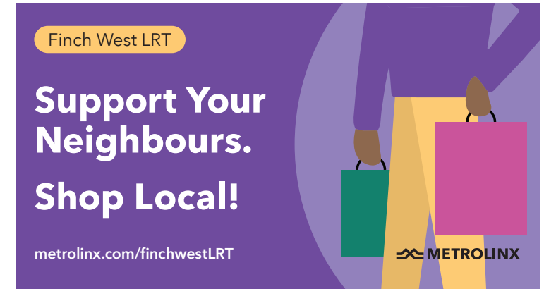
Photo: Shop Local Print Ad.