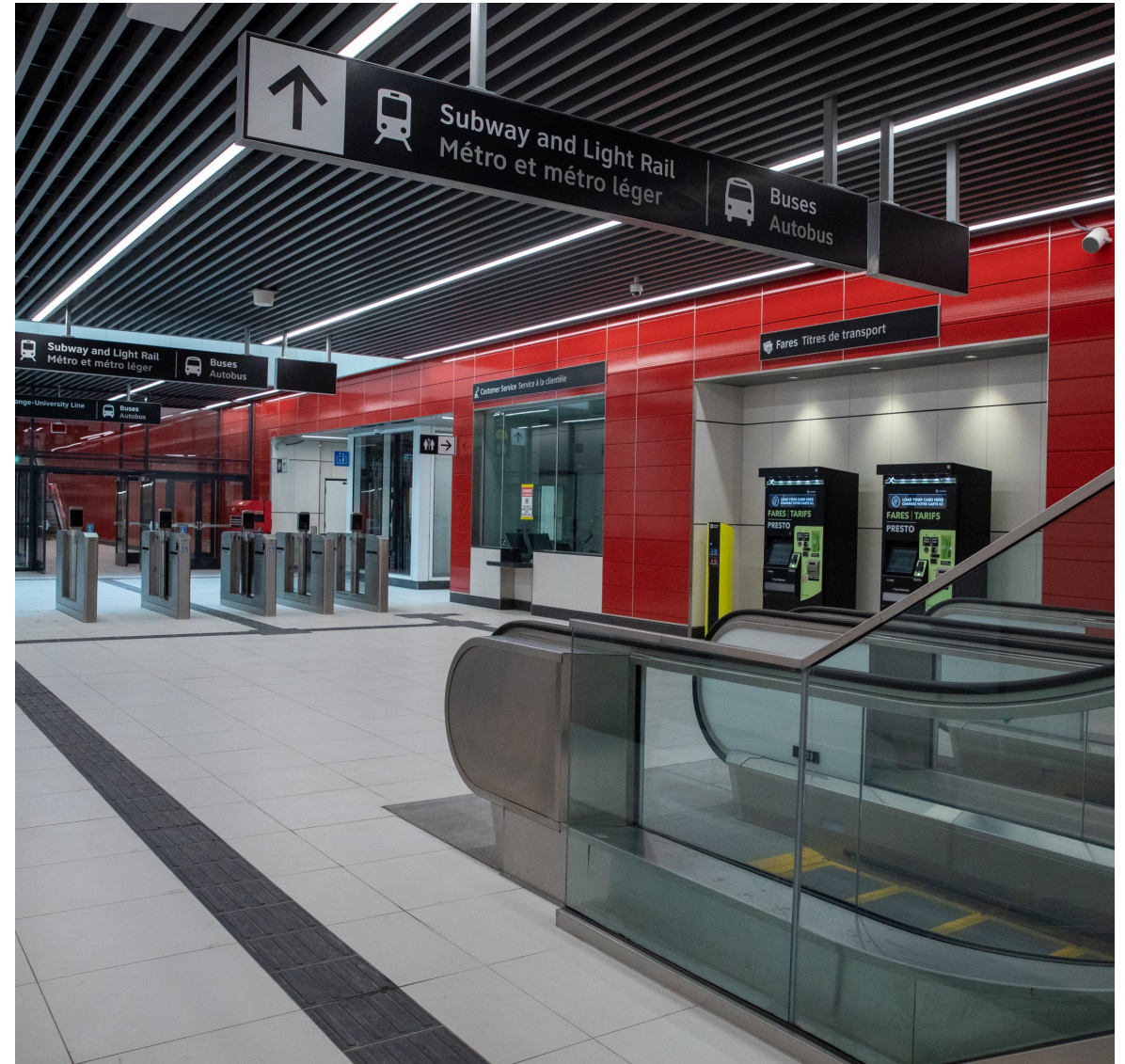
Photo: Finch West LRT station pedestrian concourse. 2024.03.28