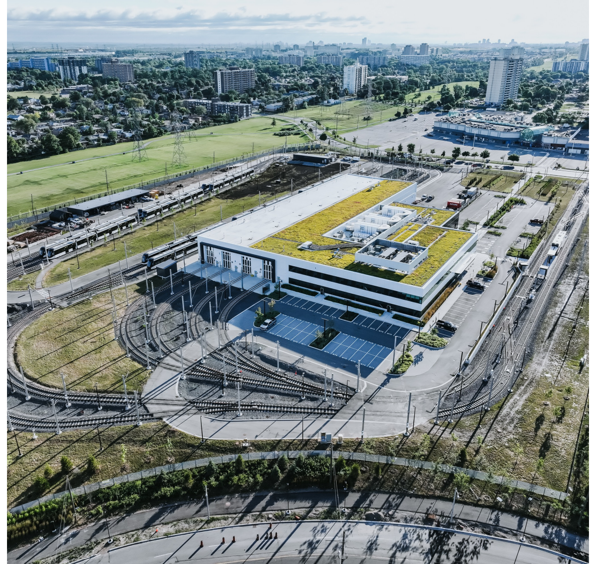
Photo: Maintenance and Storage Facility, northeast aerial view. 2024.06.22