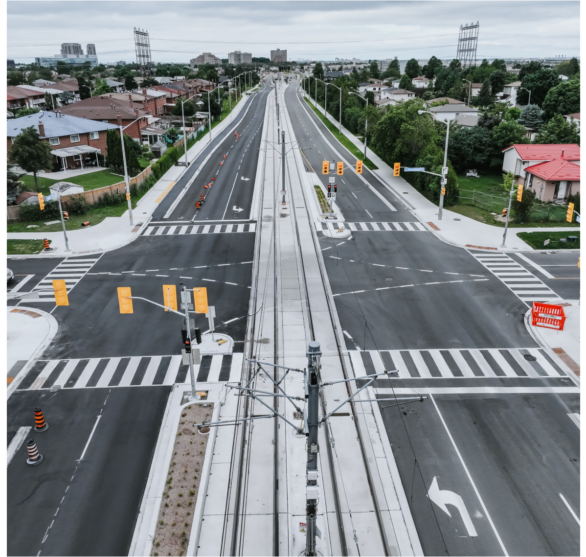
Photo: Finch Avenue West and Silverstone Drive, aerial view west. 2024.06.22