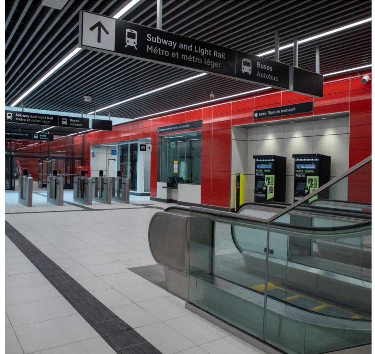
Photo: Finch West LRT station pedestrian concourse. 2024.03.28