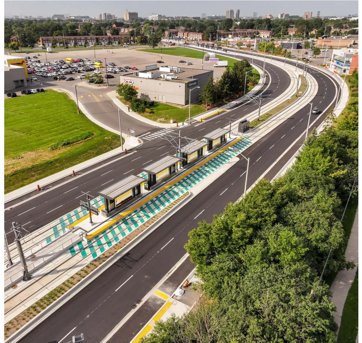
Photo: Finch Avenue West at Stevenson Stop, aerial view southwest. 2024.08.24