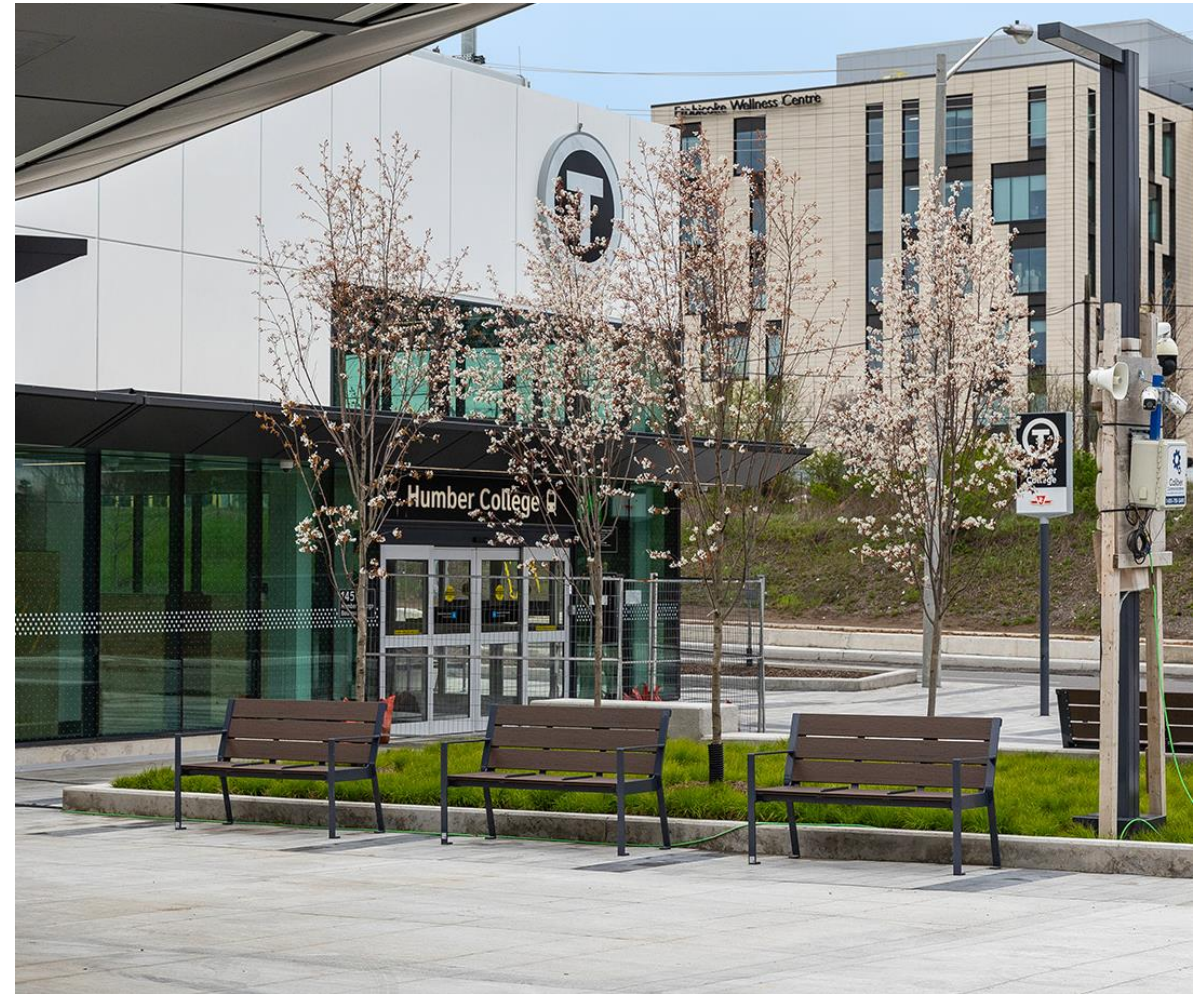
Photo: Humber College station exterior south building. 2024.04.27