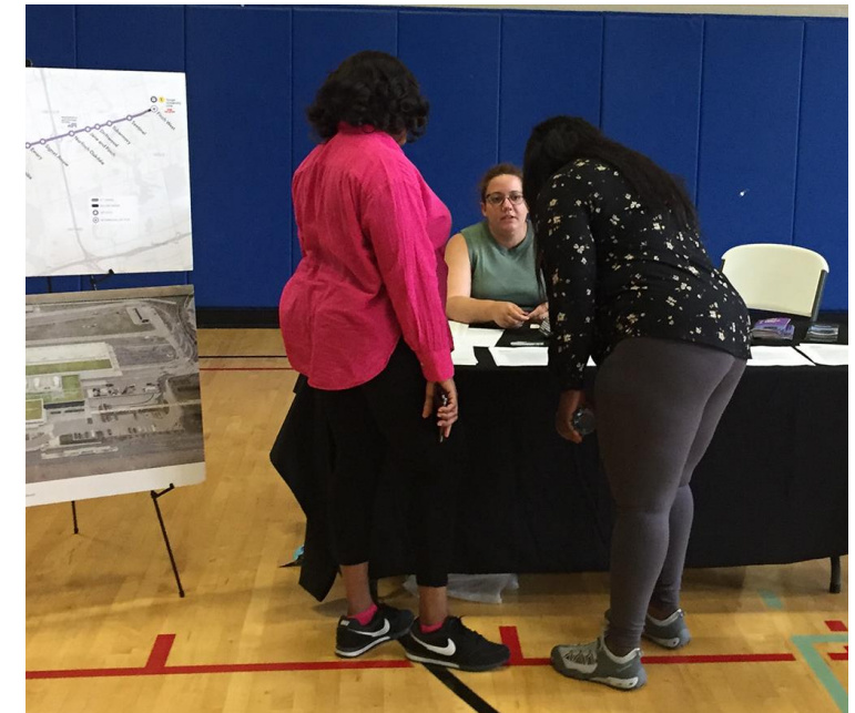
Photo: Rexdale Community Hub Job Fair.