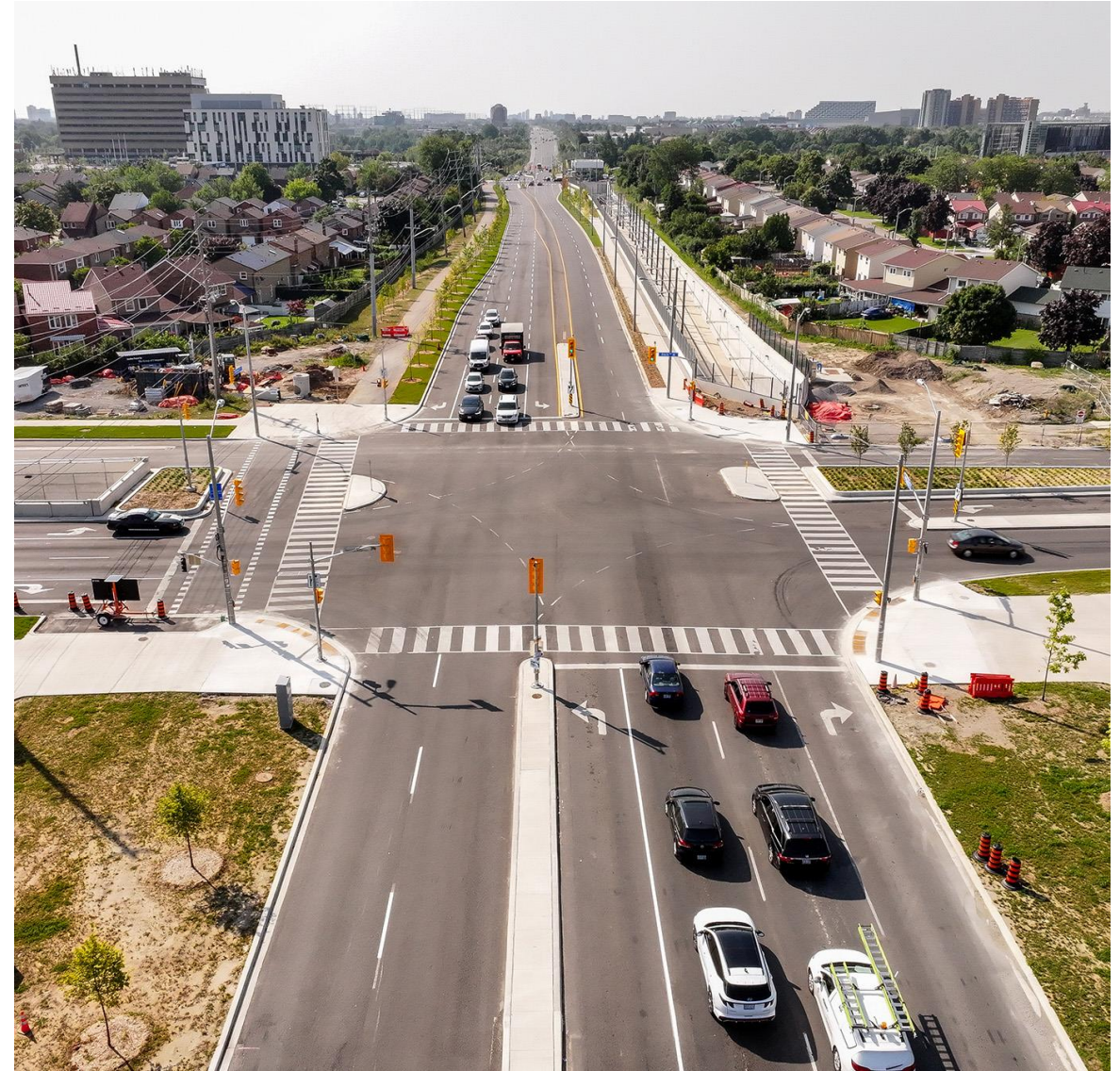
Photo: Highway 27 and Finch Avenue West, aerial view south. 2024.08.24