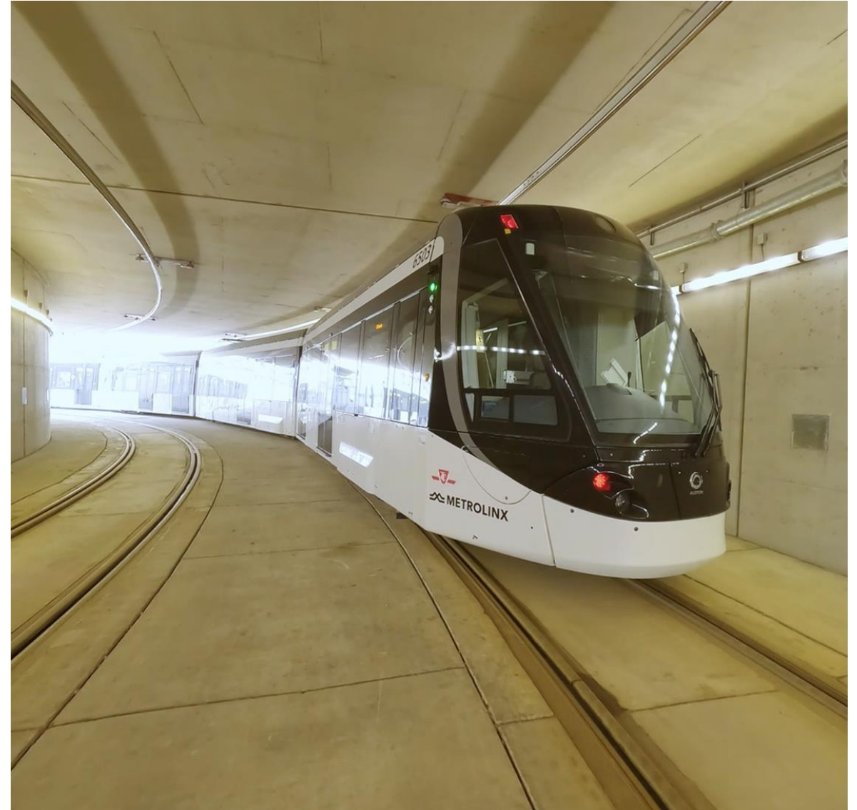
Photo: A Light Rail Vehicle travels through the Humber College portal. 2024.03.08