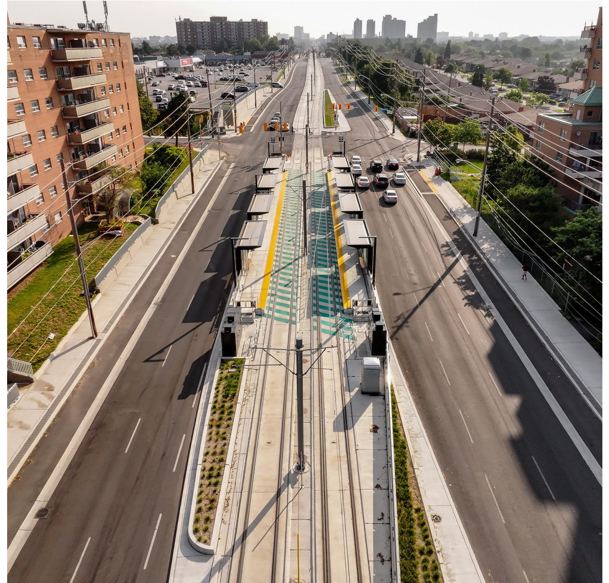
Photo: Finch Avenue West and Pearldale Avenue, aerial view west. 2024.08.24