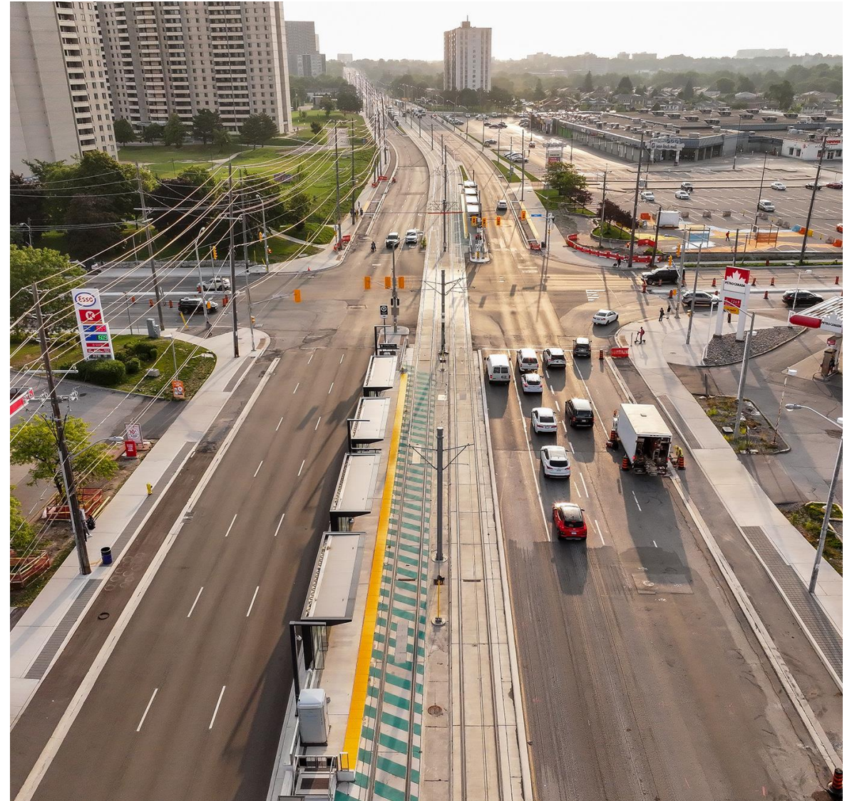
Photo: Finch West Avenue and Jane St. east aerial view 2024.08.24