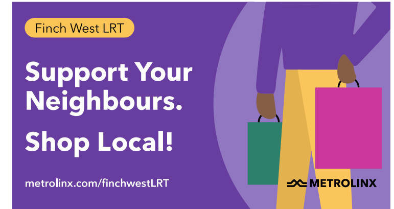
Photo: Shop Local Print Ad.