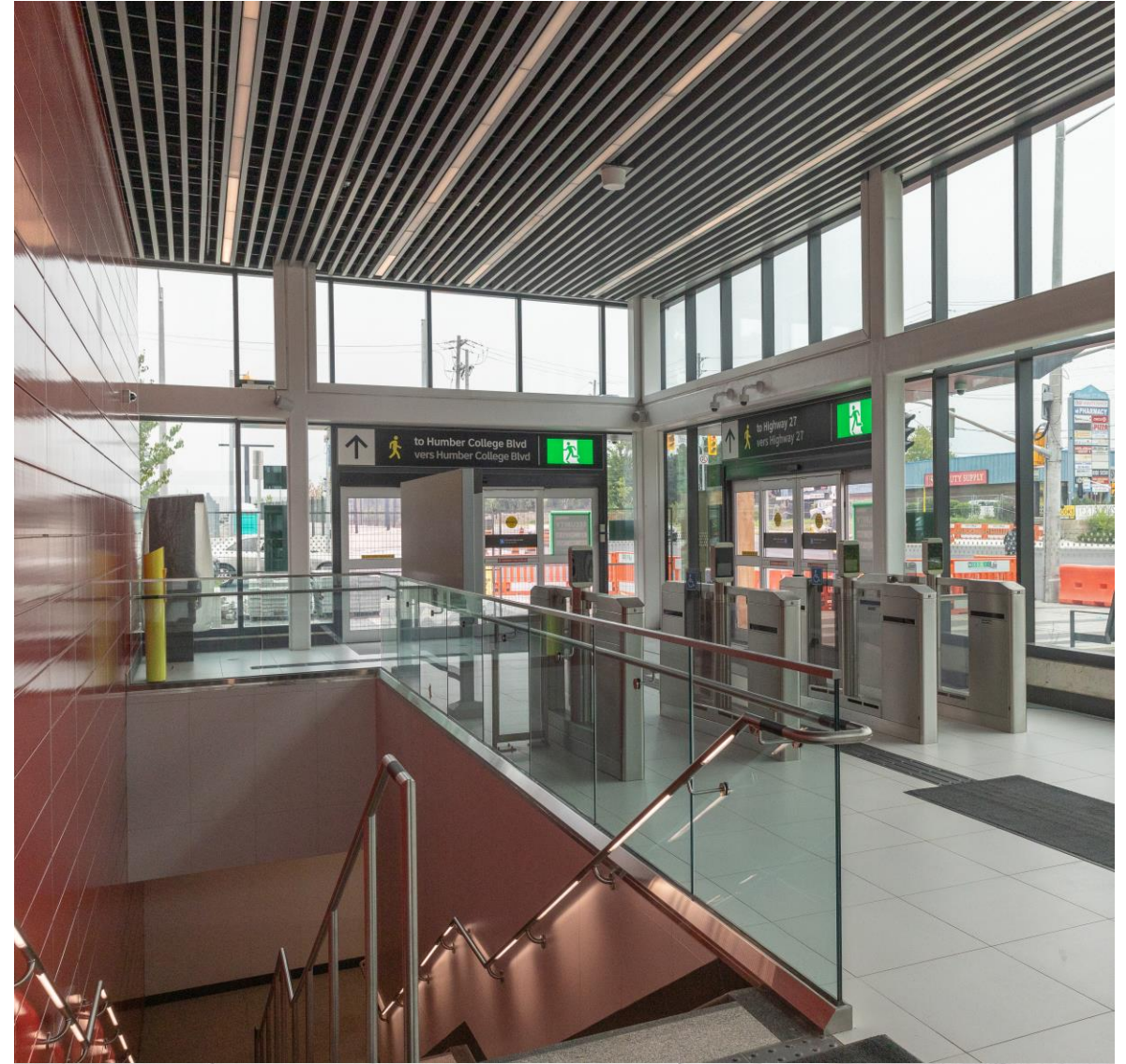
Photo: Humber College station exterior south building. 2024.06.31