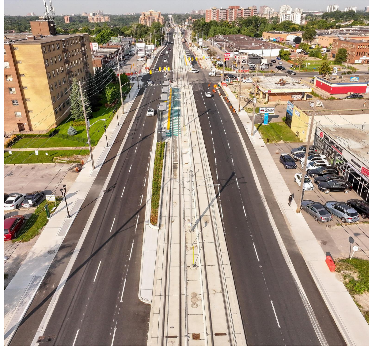
Photo: Finch Avenue West and Milvan Drive, aerial view west. 2024.08.24