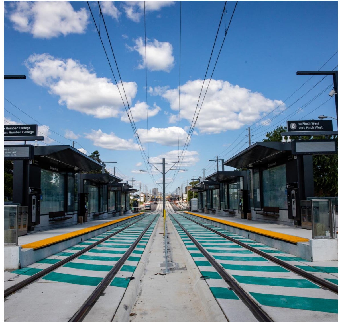
Photo: Duncanwoods stop, west view. 2024.06.22