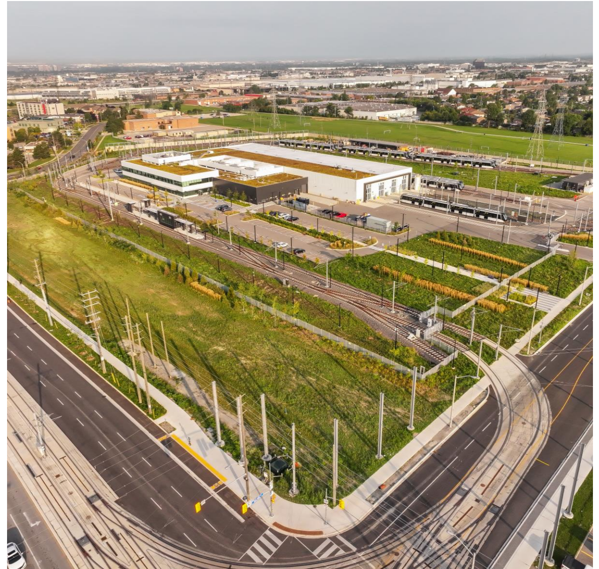
Photo: Maintenance and Storage Facility, northwest aerial view. 2024.08.24