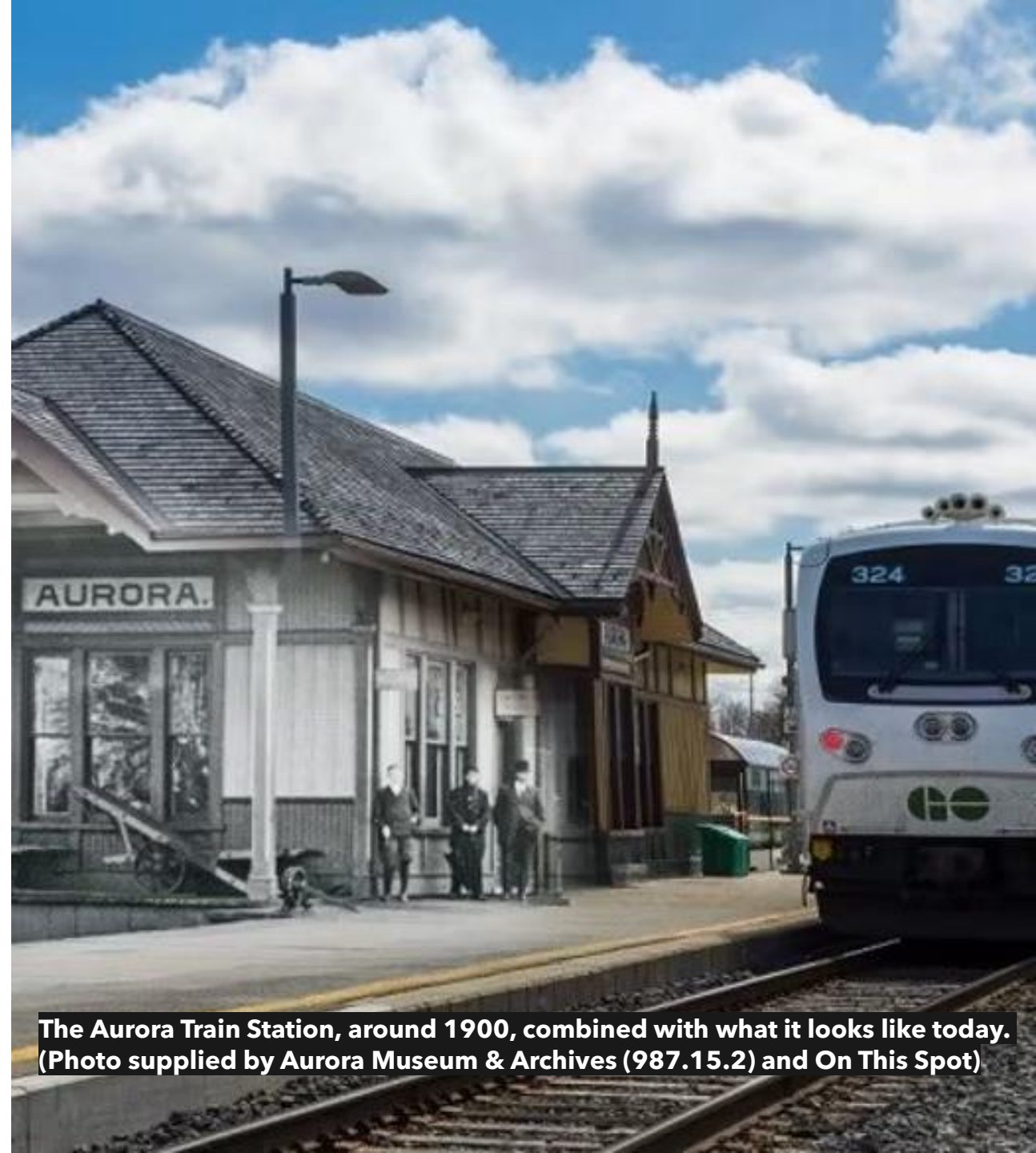
The Aurora Train Station, around 1900, combined with what it looks like today.