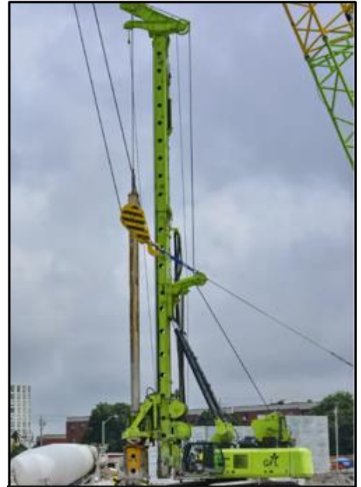
Example of a pile drilling rig