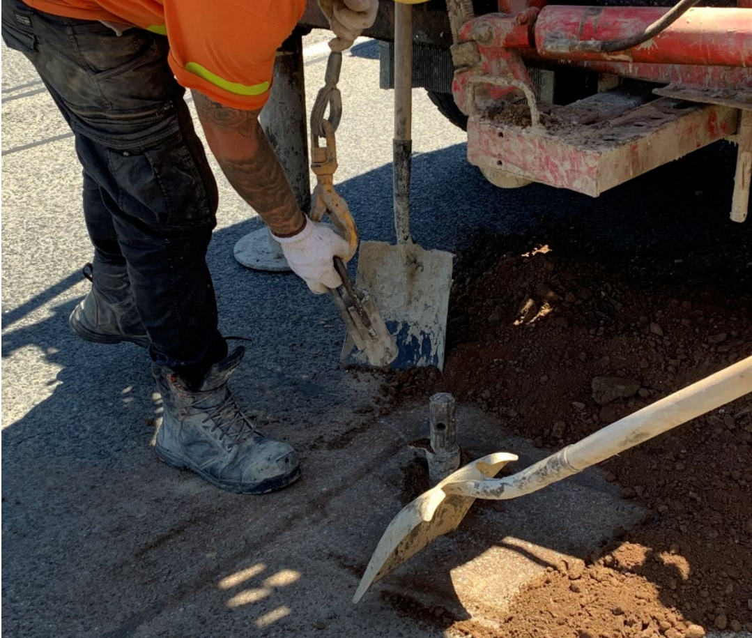
Subsurface Utility Engineering (SUE)