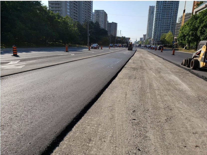
Median Removals and Paving