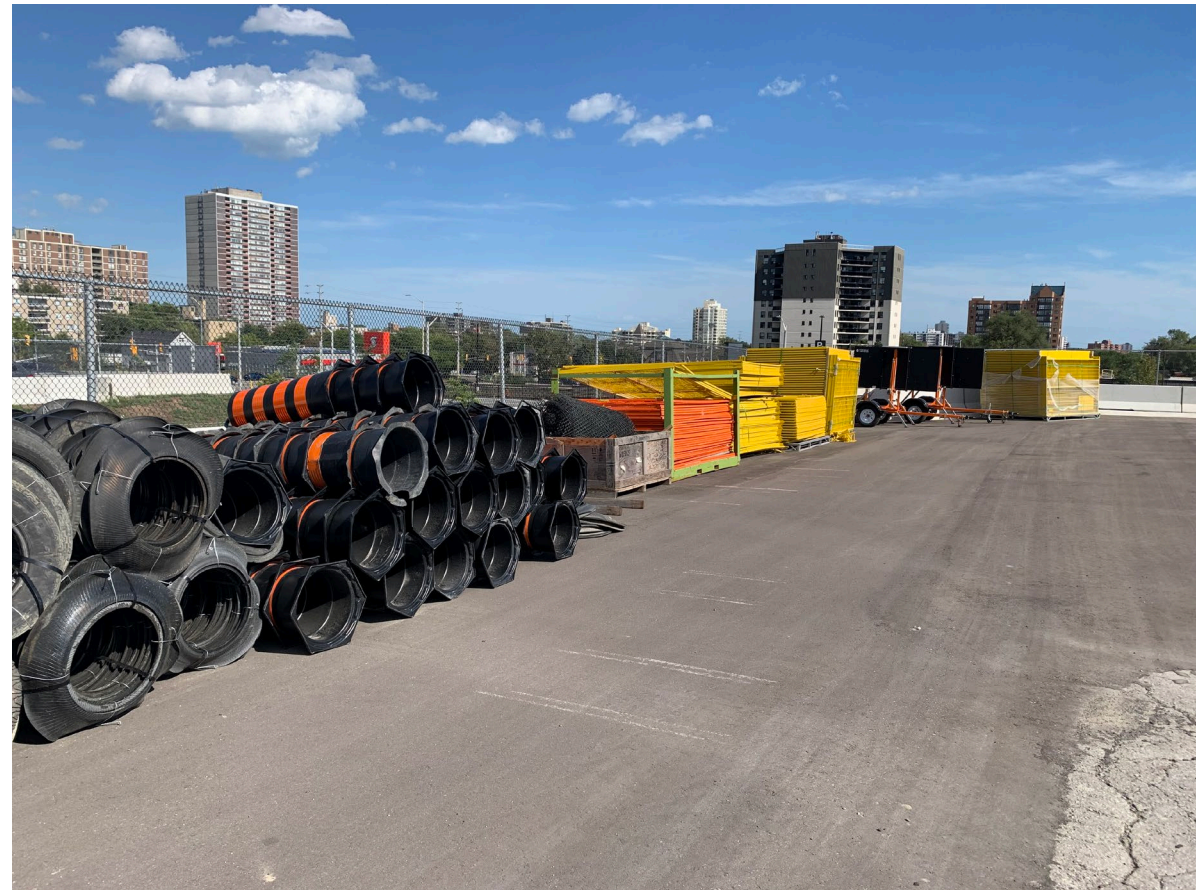
Cooksville Laydown Area