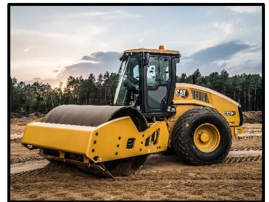
Figure 3: Compactor