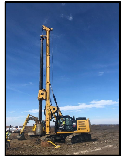
Figure 1: Drill Rig