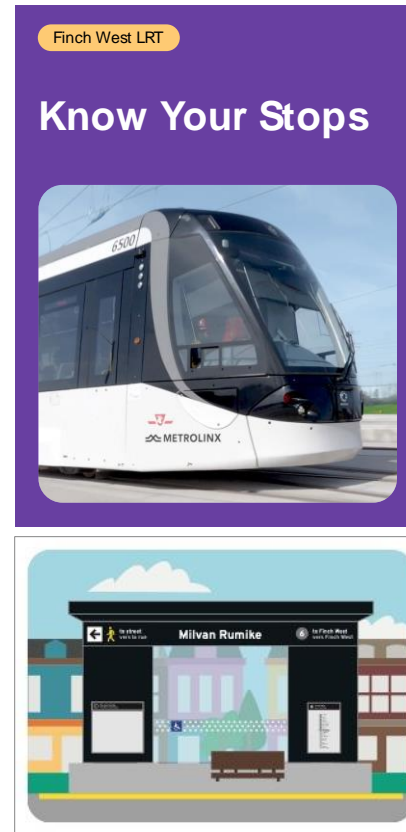
Photo (Top): Know Your Stops brochure and Stops Sticker for Milvan Rumike.