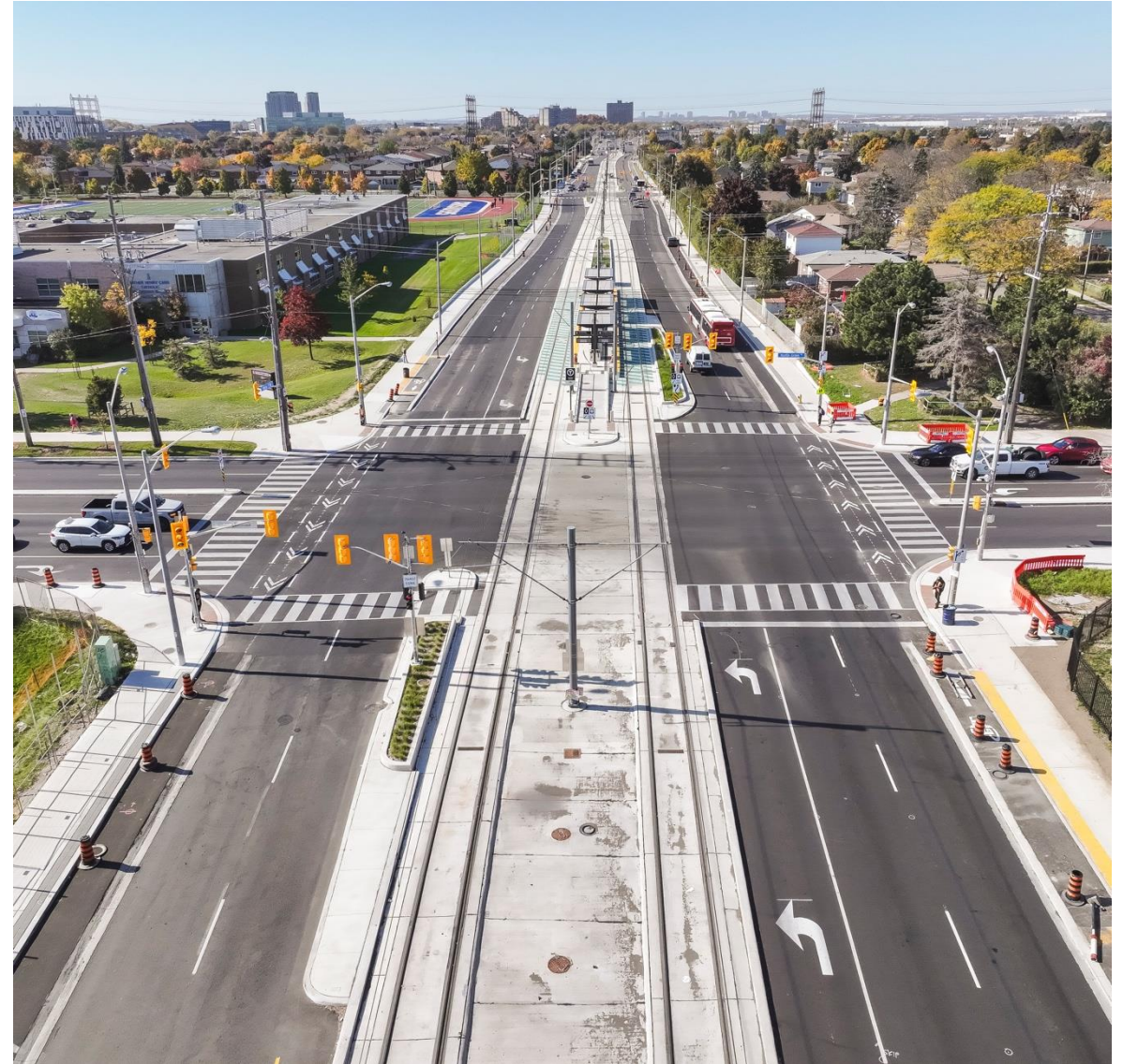
Photo: Finch Avenue West at Martin Grove Road, southwest aerial view. 2024.10.21