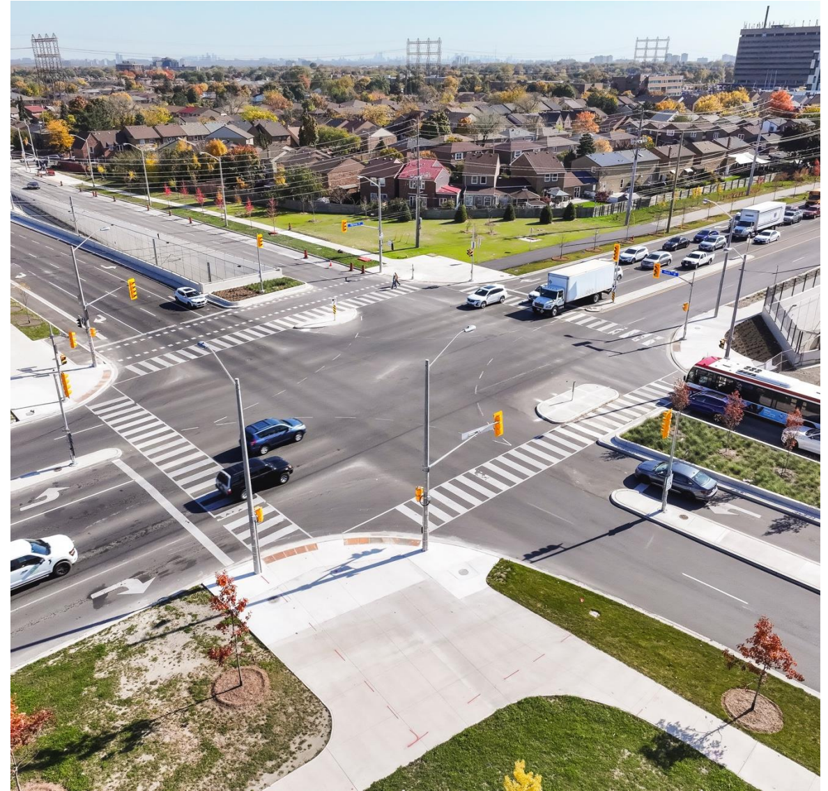
Photo: Highway 27 and Finch Avenue West, aerial view southeast. 2024.10.21