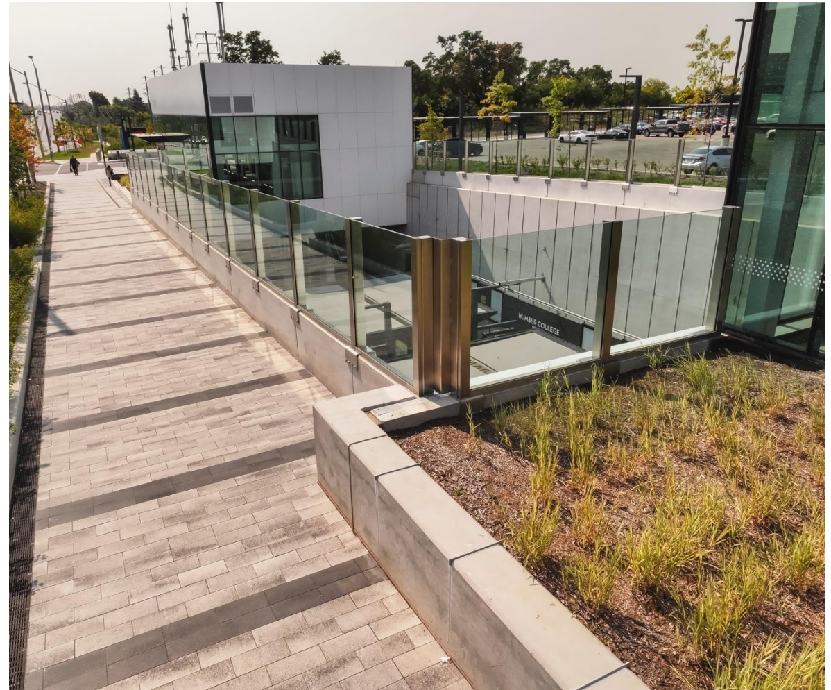
Photo: Humber College station exterior south building. 2024.10.01