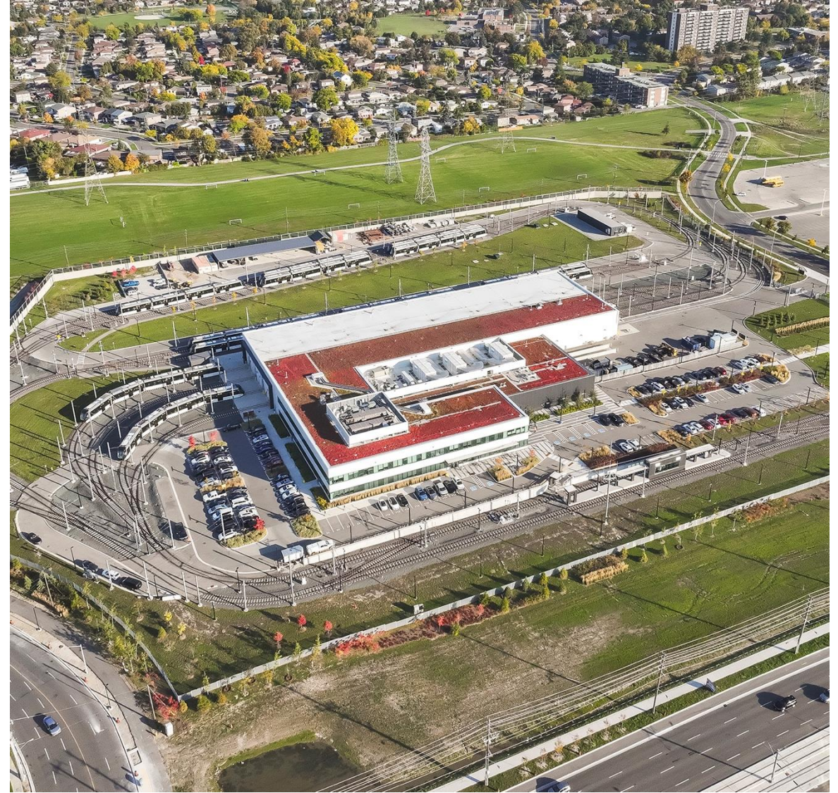
Photo: Maintenance and Storage Facility, northeast aerial view. 2024.10.21