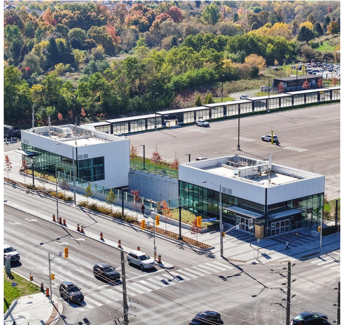
Photo: Humber College station, aerial view southwest. 2024.10.21