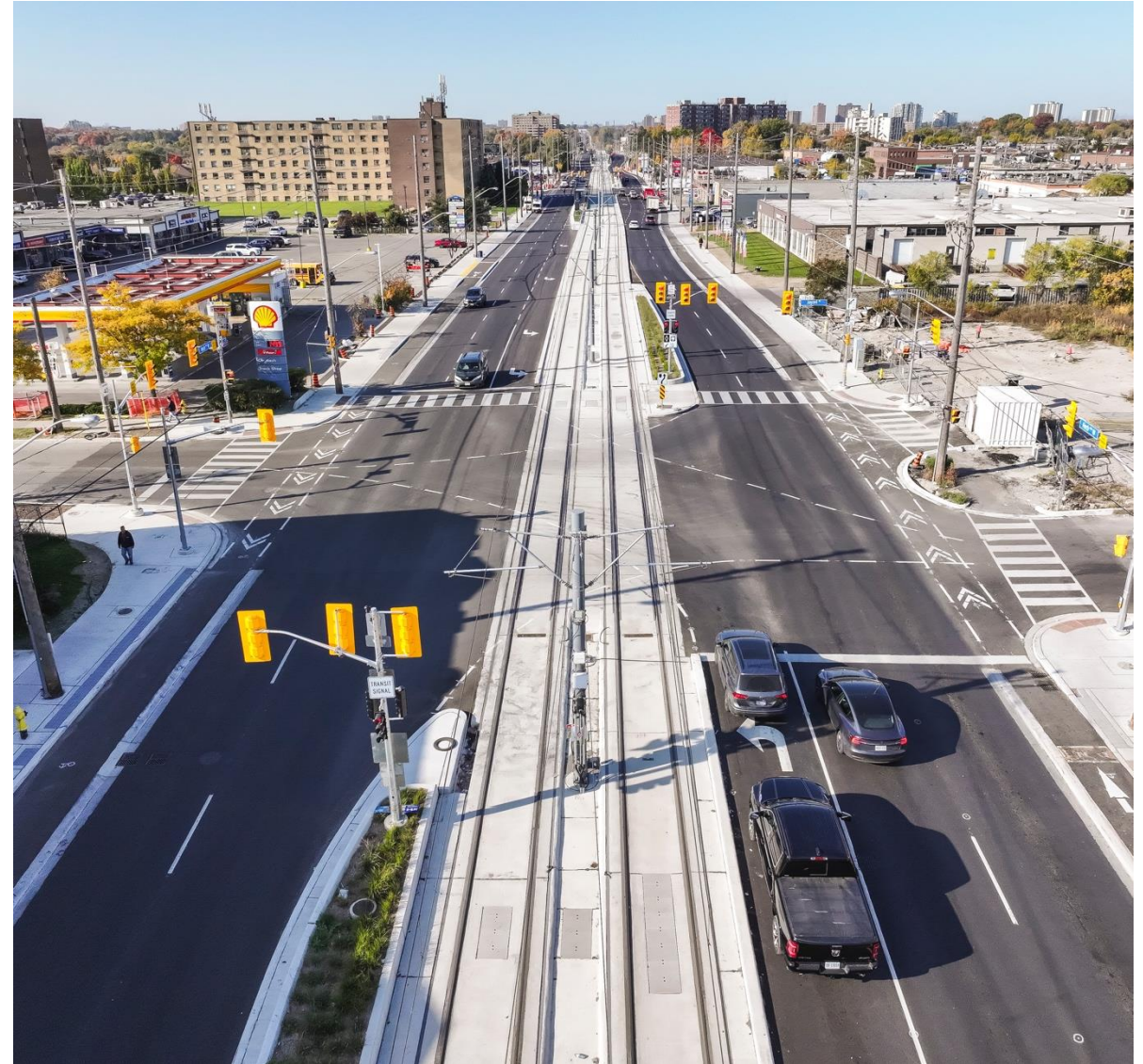
Photo: Finch Avenue West and Jayzel Drive, aerial view west. 2024.10.21