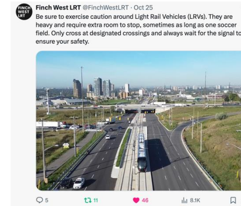
Photo: Social media safety post.