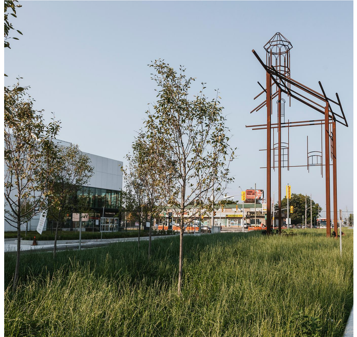
Photo: Finch Avenue West median in front of Finch West station. 2024.09.14