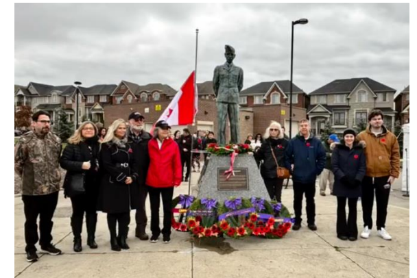
Photo: Remembrance Day at Joesph Bannon Park, Emery Village celebration 2024.