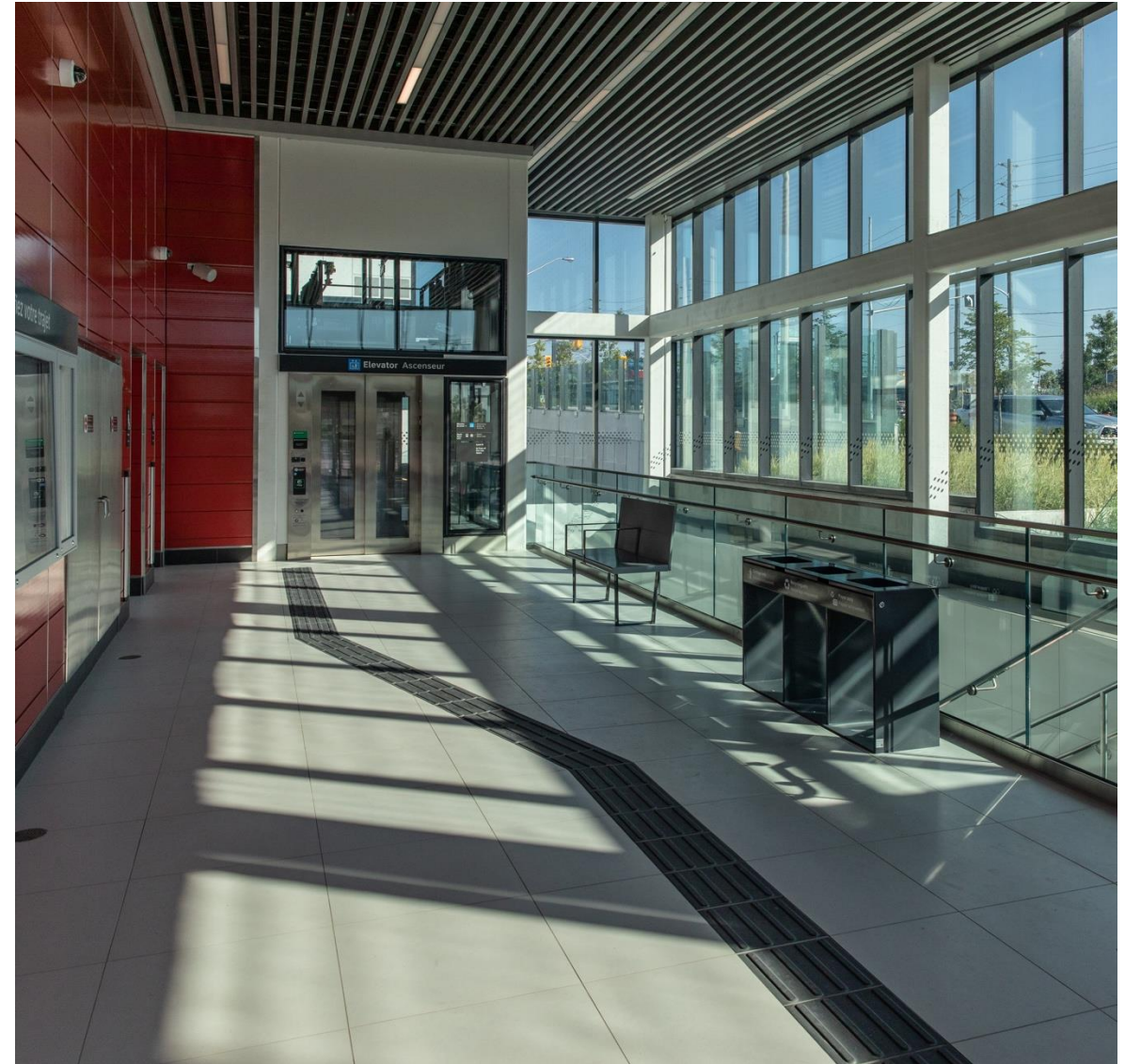
Photo: Humber College Station, south building interior. 2024.08.24