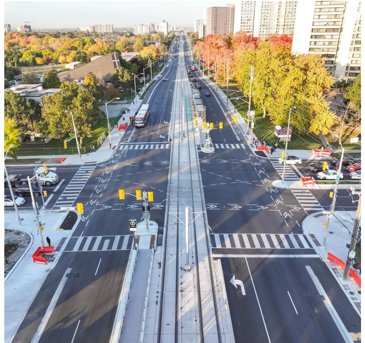
Photo: Finch Avenue West and Sentinel Road, aerial view west 2024.10.21