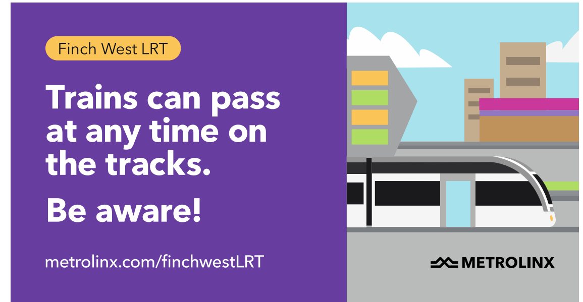
Photo: LRV and Guideway Safety campaign billboard ad.