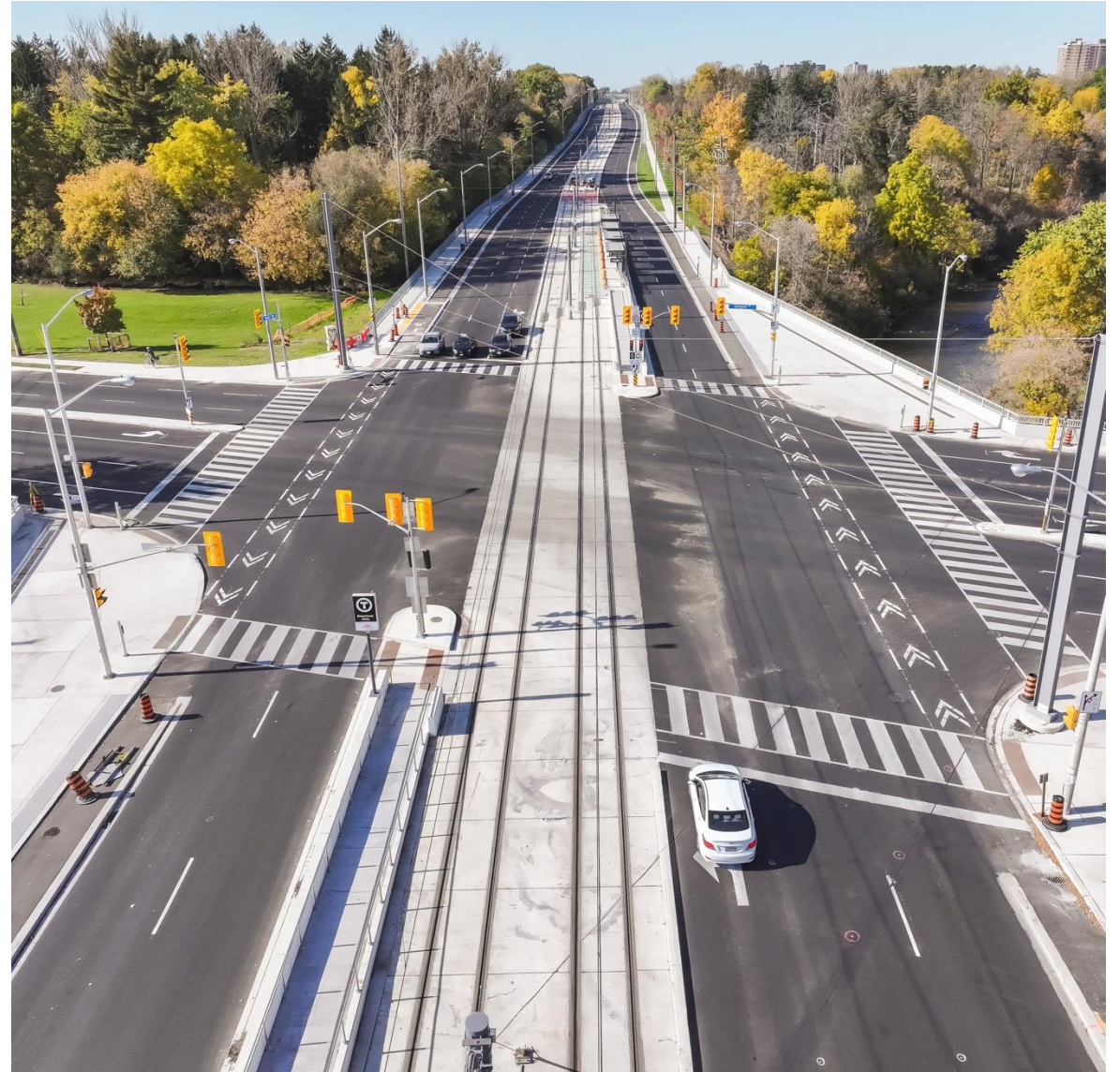
Photo: Finch Avenue West and Islington Avenue, aerial view west. 2024.10.21