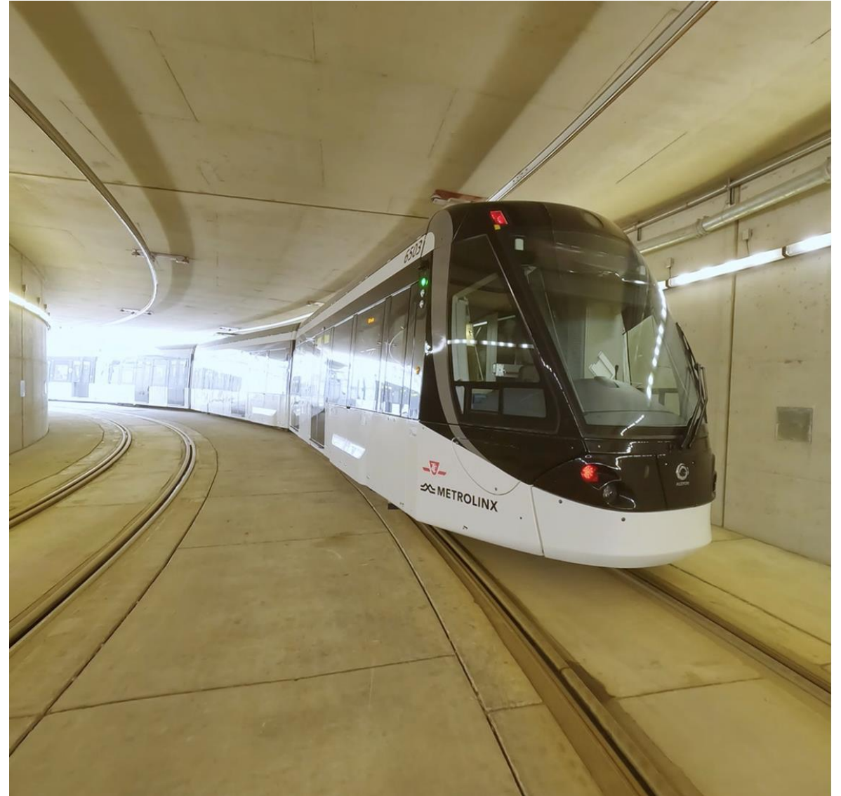
Photo: A Light Rail Vehicle travels through the Humber College portal. 2024.03.08