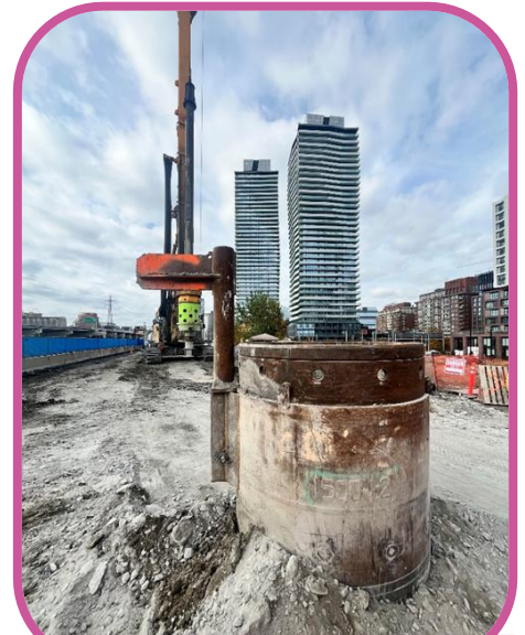
Auger cleaning tool