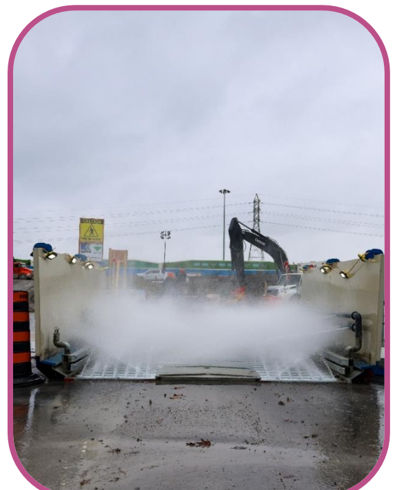
Wheel wash station used to keep roads clean