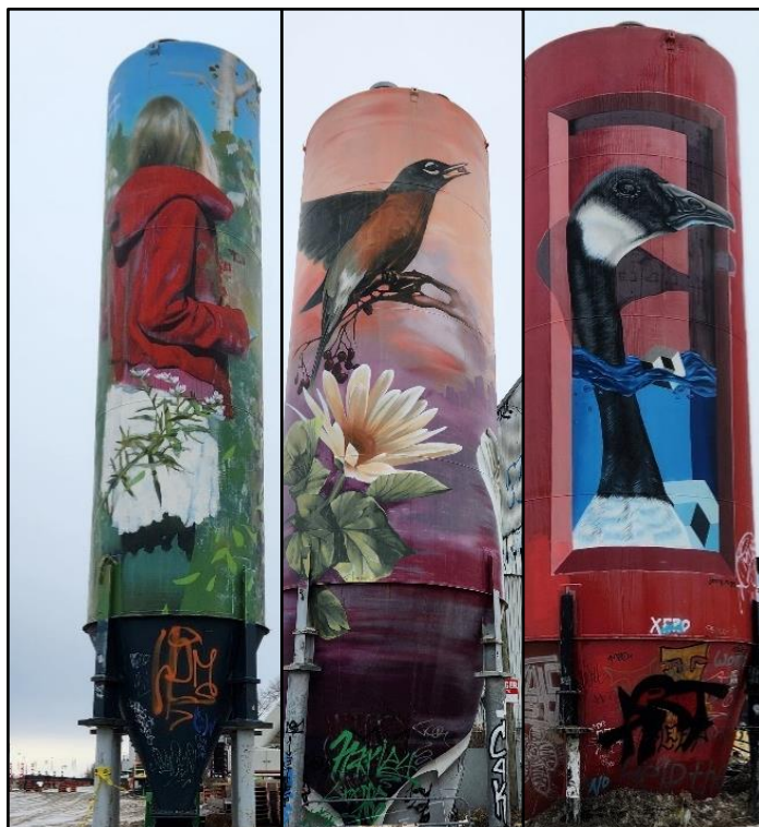
Silos to be removed at Fraser Ave (first image), Jefferson and Atlantic Ave (second image), and South Liberty Trail (third image).