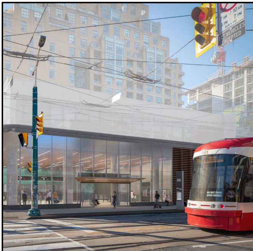
Future Queen-Spadina station.

To register, please visit the Metrolinx Ontario Line events page link or scan the QR code below: