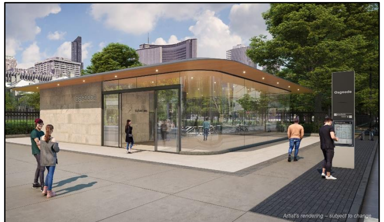
Future Ontario Line Osgoode North Station

To register, please visit the Metrolinx Ontario Line events page link or scan the QR code: metrolinx.com/en/projects-and-programs/ontario-line/events