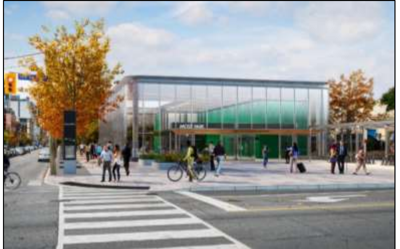
Future Moss Park Station.

The open house event is free to attend, and you are encouraged to register online in advance to stay up to date on the Ontario Line subway project.