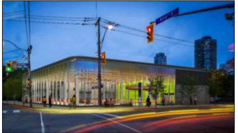
Future Ontario Line Station in Corktown

To register, please visit the Metrolinx Ontario Line events page link or scan the QR code: metrolinx.com/en/projects-and-programs/ontario-line/events