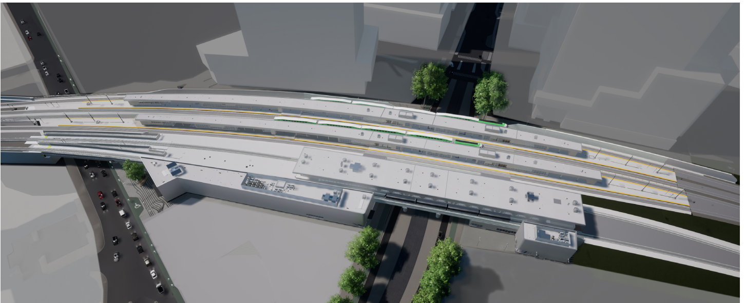
The new East Harbour Transit Hub. All renderings are subject to change.