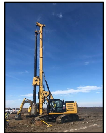
Figure 1: Drill Rig