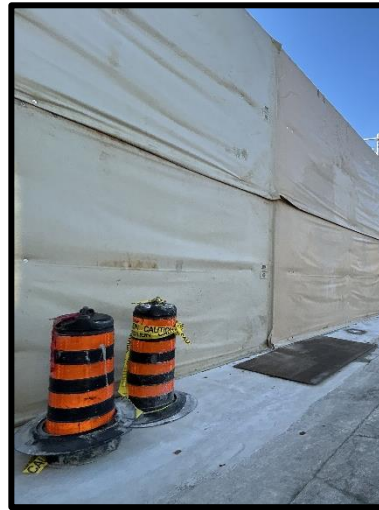
Figure 2: Sound Wall