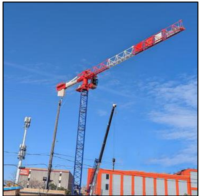
An existing tower crane in use supporting Ontario Line construction.