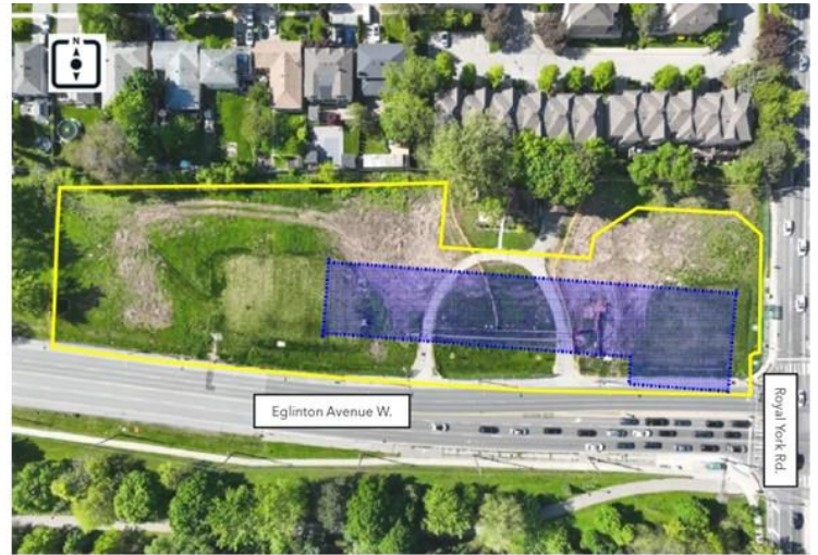
Royal York Road