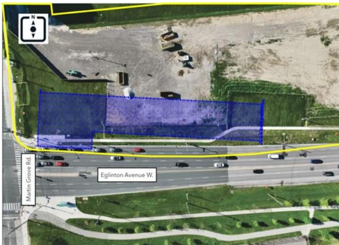
Martin Grove Road