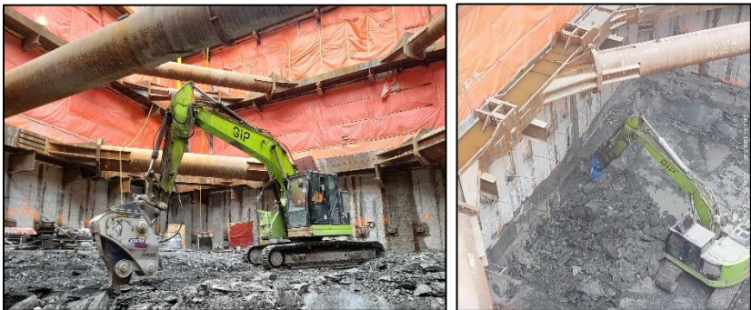
Noisie blankets in use on large hammer attachment