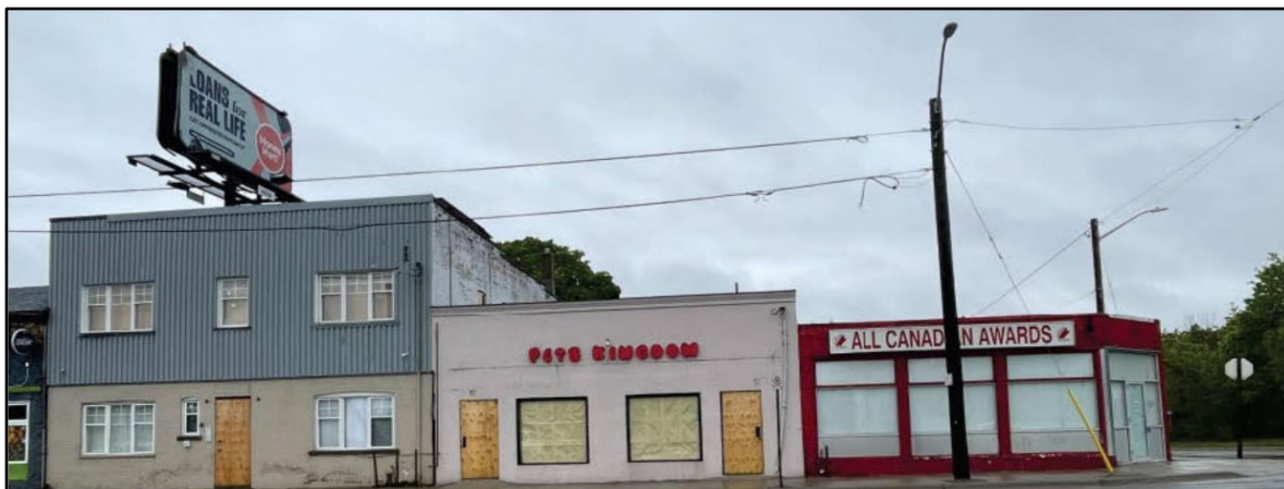
Figure 1 Building Demolition Overview