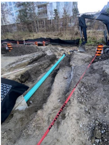
# 1 In-corridor drainage and utility works

Completed activity #2: Demolition of the existing sidewalk on Dupont Street began November 2025.