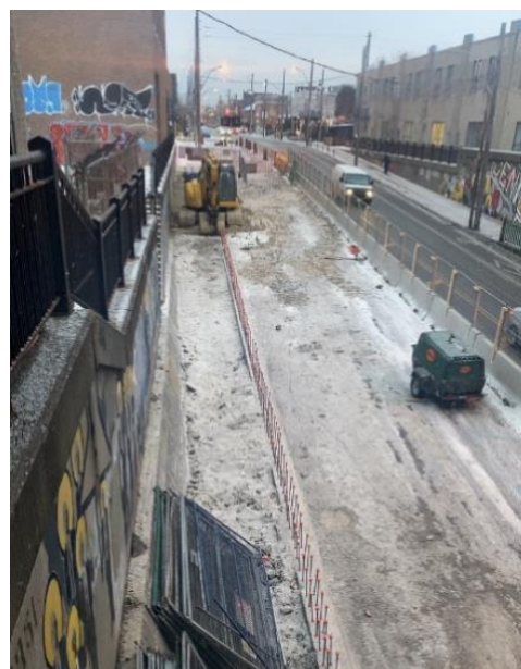
# 2 Sidewalk demolition on Dupont Street (facing west)