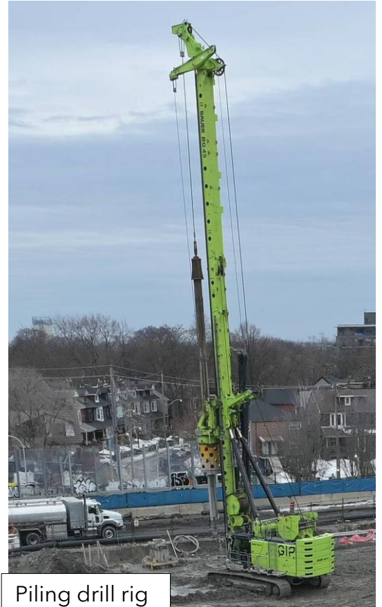
Piling drill rig