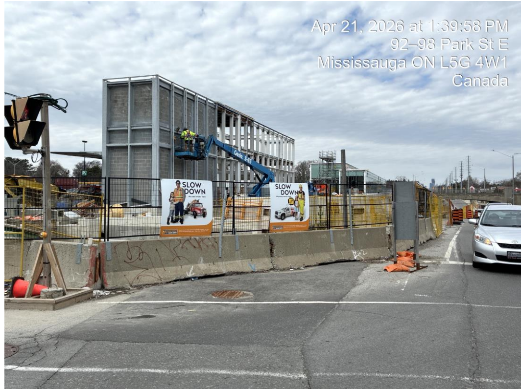
Port Credit Station