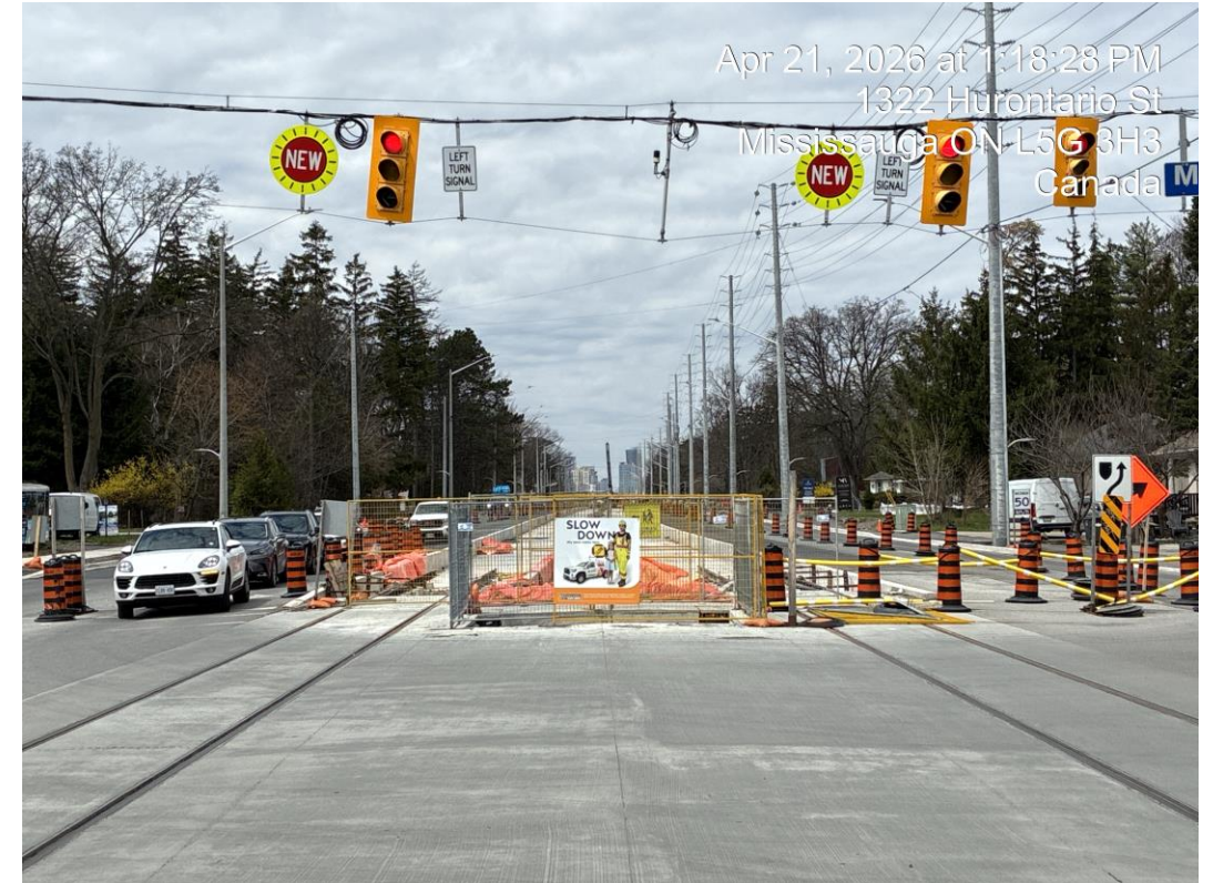
Mineola and Hurontario