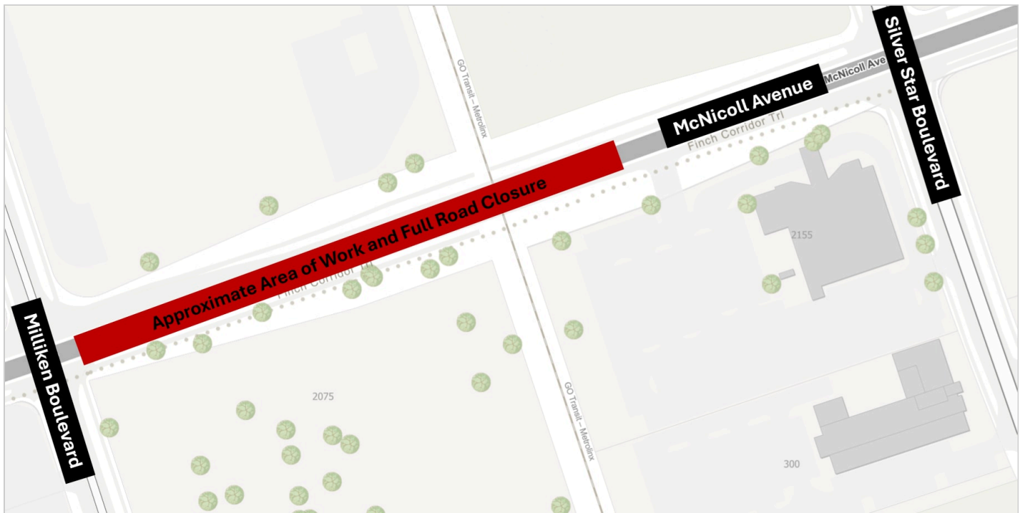
Figure 1: Approximate area of work zone. Not to scale. Metrolinx image.

Working Hours: Friday 10:00 p.m. to Sunday 12:00 a.m., 24 hours